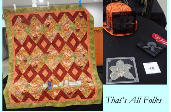
That's All Folks