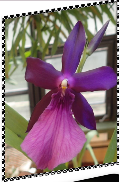
Miltonia bluntii , native to the mountains near Rio de Janeiro