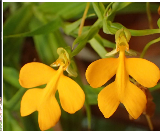
Closeup of Hab. rhodocheila , the yellow form. (Nile D)

Habenaria are terrestrial and often lithophytic plants native to SE Asia: Thailand, Laos, Cambodia, Vietnam, Malaya, China, and the Philippines. They grow from lowland meadows to mountain altitudes up to 3600 feet. Plants grow from small round corms with a single stem that flowers at the apex. After flowering they tend to die back and when leaves drop a rest period with very little water is suggested. Media suggested is compost with adequate drainage. Joel grows his on sphagnum moss and says that sometimes the plants go dormant only for a short period of time. He puts Styrofoam peanuts in the bottom of the pot to insure excellent drainage. Nile D