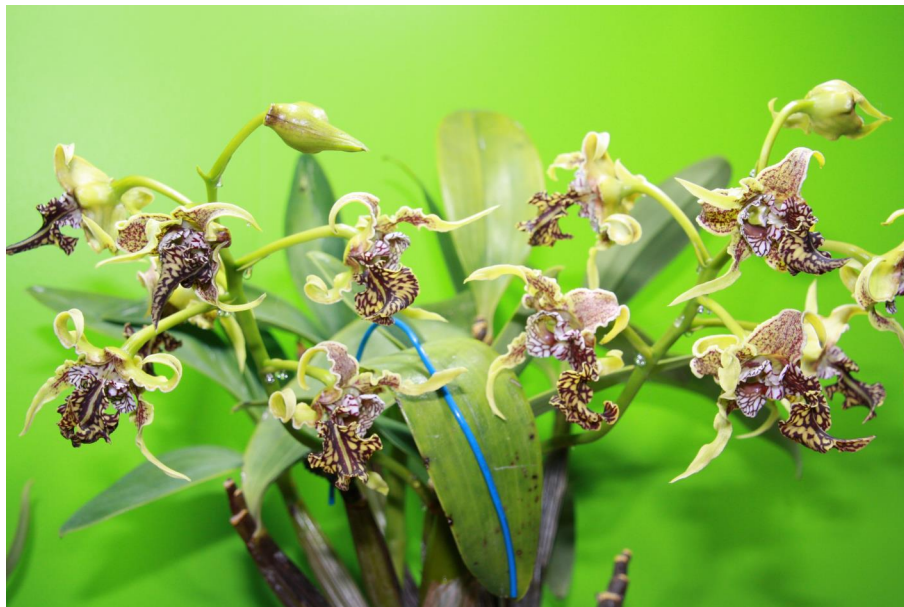
THIS IS A WEIRD ONE! Dendrobium spectabile native to the Polynesian islands of the eastern Pacific. Grown by Bruce Byorum, grotesquely beautiful!

A small group of people with a big love of growing orchids.