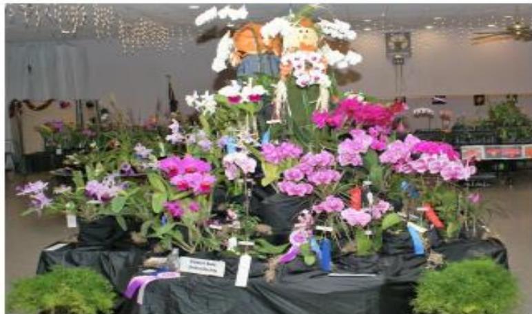
Eastern Iowa Orchid Society Display at the 'Orchids Are A Scream' show