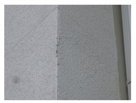
The exterior siding has been installed notably not level on the front of the home at the fourth floor deck area.