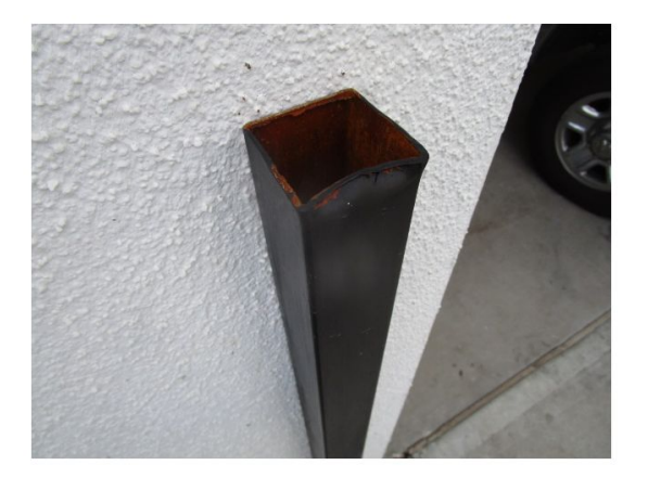
There is minor corrosion on some areas of the metal fencing and some areas are not completely painted.

The cap is not installed on the metal fence post next to the home which will allow water to fill the pipe and promote further corrosion.