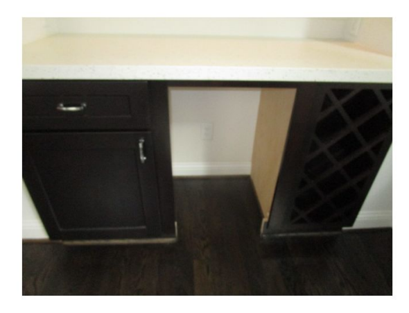
VI. OPTIONAL SYSTEMS

☐ ☑ ☑ ☐ A. Landscape Irrigation (Sprinkler) Systems