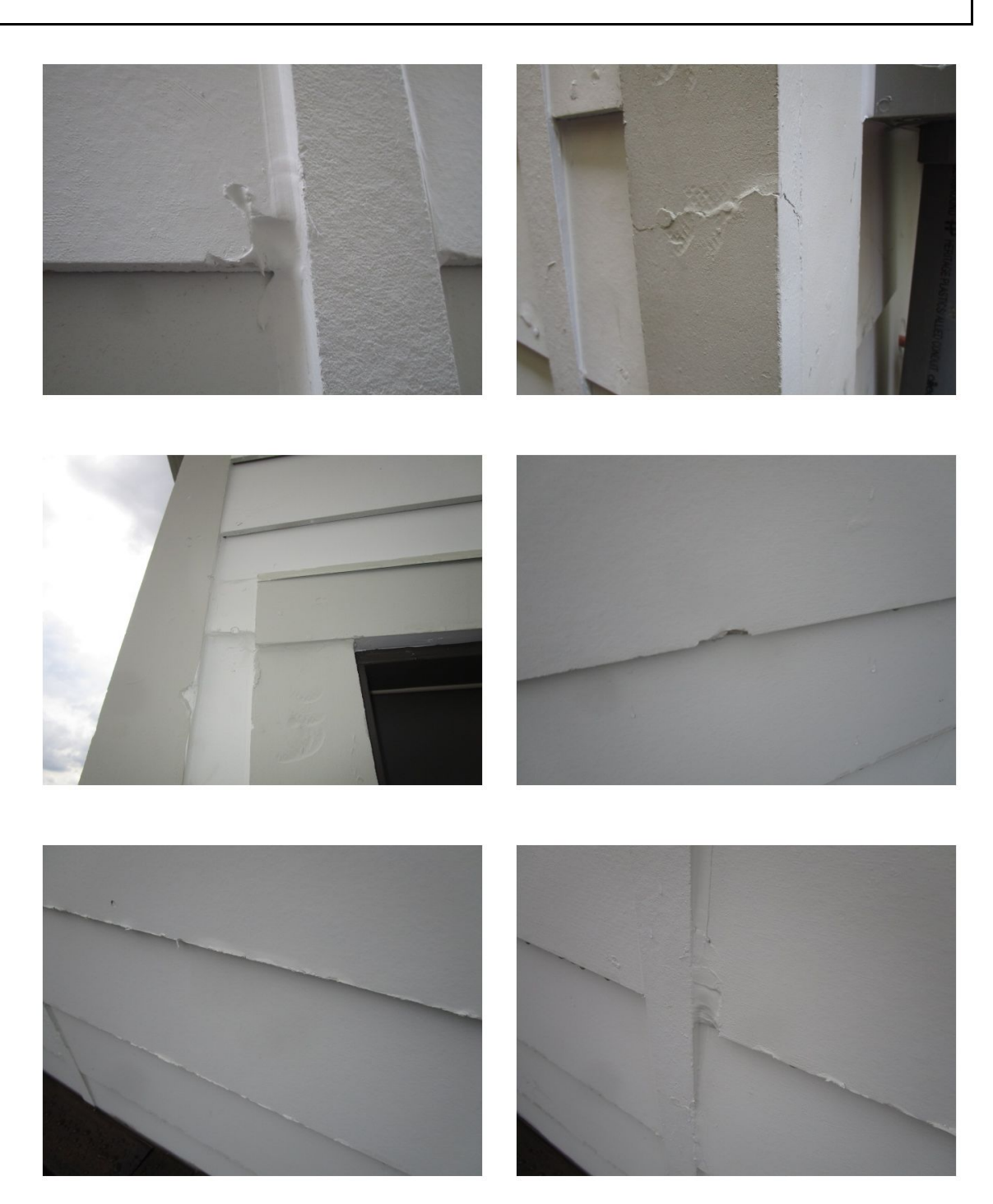
<u>It is recommended that all exterior trim be sealed where it meets the siding and stonework in order to prevent possible water penetration.</u>