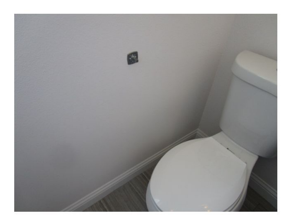
The mirrors are not installed in the bathrooms.