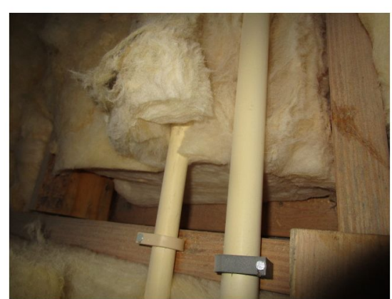
E. Walls (Interior and Exterior)

Comments: The exterior paint is not complete in some areas.