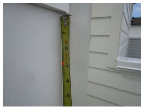
There are large gaps under the stucco walls at the front of the garage where the bottom wall plates are not complete and the walls are cantilevered off the foundation leaving the structure exposed.