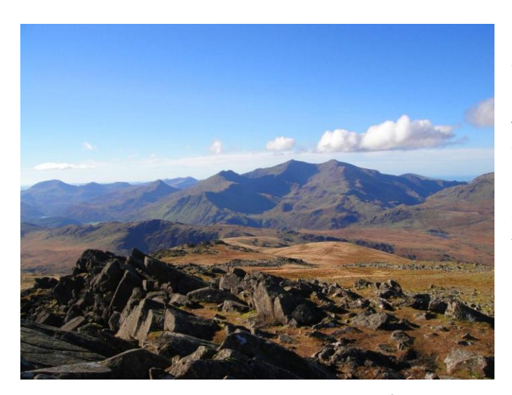
The Nantlle Ridge, Aran, Snowdon and Lliwedd from Siabod

But we missed the mountains. In July when lockdown was eased, where did we go for our first unofficial high walk? Moel Siabod!