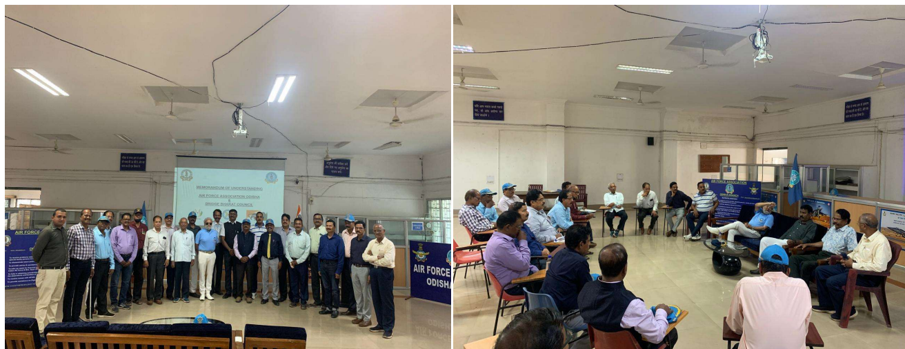
ANNUAL GENERAL MEETING AND MoU SIGNING WITH BRIDGE BHARAT COUNCIL FOR PROMOTION OF INNOVATION, RESEARCH & ENTREPRENEURSHIP IN PRESENCE OF OFFICIALS OF AFA ODISHA BRANCH AND VICE PRESIDENTS/ REPS OF AFA ODISHA DISTRICT CHAPTERS AND ON 09 MAR 25 AT 9 ASC, BHUBANESWAR