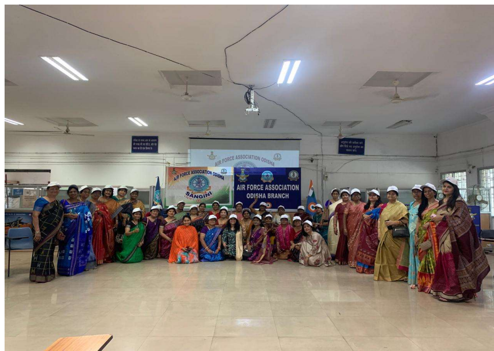
FORMATION OF AIR FORCE ASSOCIATION ODISHA BRANCH LADIES WING (SANGINI/S) ON INTERNATIONAL WOMEN'S DAY AT 9 ASC, BHUNANESWAR