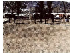
Dry lots and turnouts