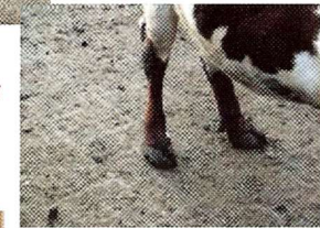
The filling consists of sand or fine gravel.