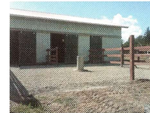
A layer of gravel may be required beneath the grids.

Below are three pictures that illustrate the principles and installation. Although a foundation base is not always necessary, prevailing ground conditions affect its proper application. Please contact us for more information.