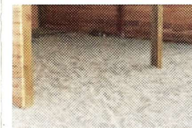
Sand or fine stone is used for the top layer, about 2" to 3" deep....