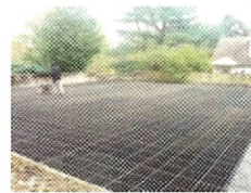
Outdoor/indoor exercise pens or riding arenas