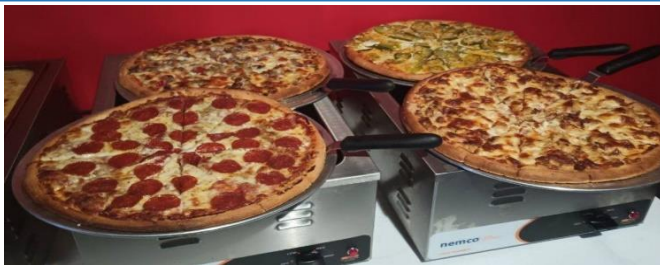
Full Size Pizza's