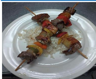
Steak Kabob W/ Rice