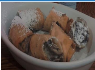
Oreo Egg Rolls