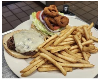
Fried Banana Pepper Burger