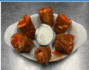
Chicken Wing Egg Rolls