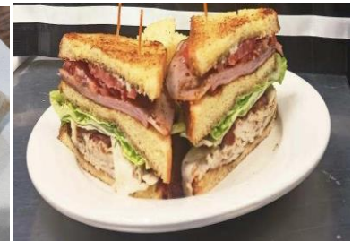
Pick's Club Sandwich

Fish - Served with Cole Slaw and choice of Mac & Cheese or French Fries.