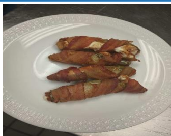
Bacon-Wrapped Stuff Pickles