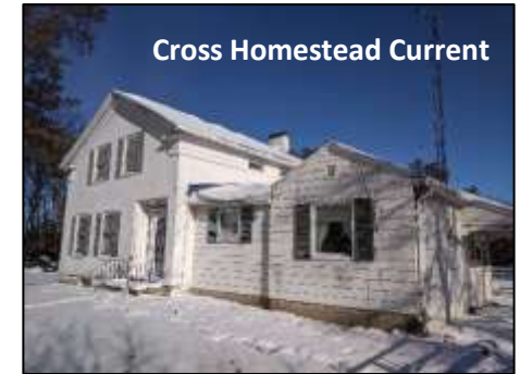
Cross Homestead Current