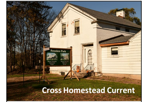
Cross Homestead Current