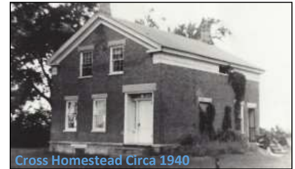
Cross Homestead Circa 1940