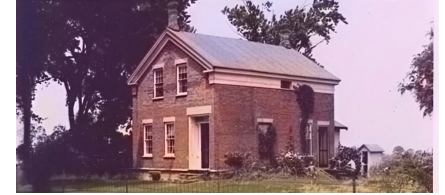
Cross Homestead Circa 1940

All of our IRS 990 tax returns are on our website