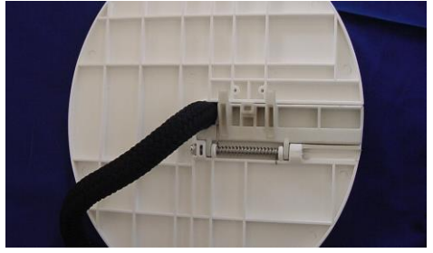
Once the door is closed, the mooring line should look like the above picture.

Holding the mooring line in the palm of the hand, place the thumb on the handle of the door and press until the door is fully closed.