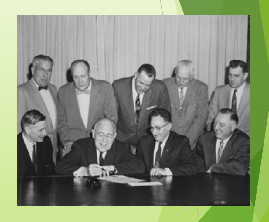
PFSC Founding Fathers

► Concerned by the lack of regulations to protect our environment and our resources, as well as the political meddling in the activities of the PA Game Commission and the Fish and Boat Commission, they set out to organize PA's sportsmen into one voice.