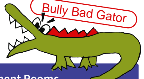
Bully Bad Gator