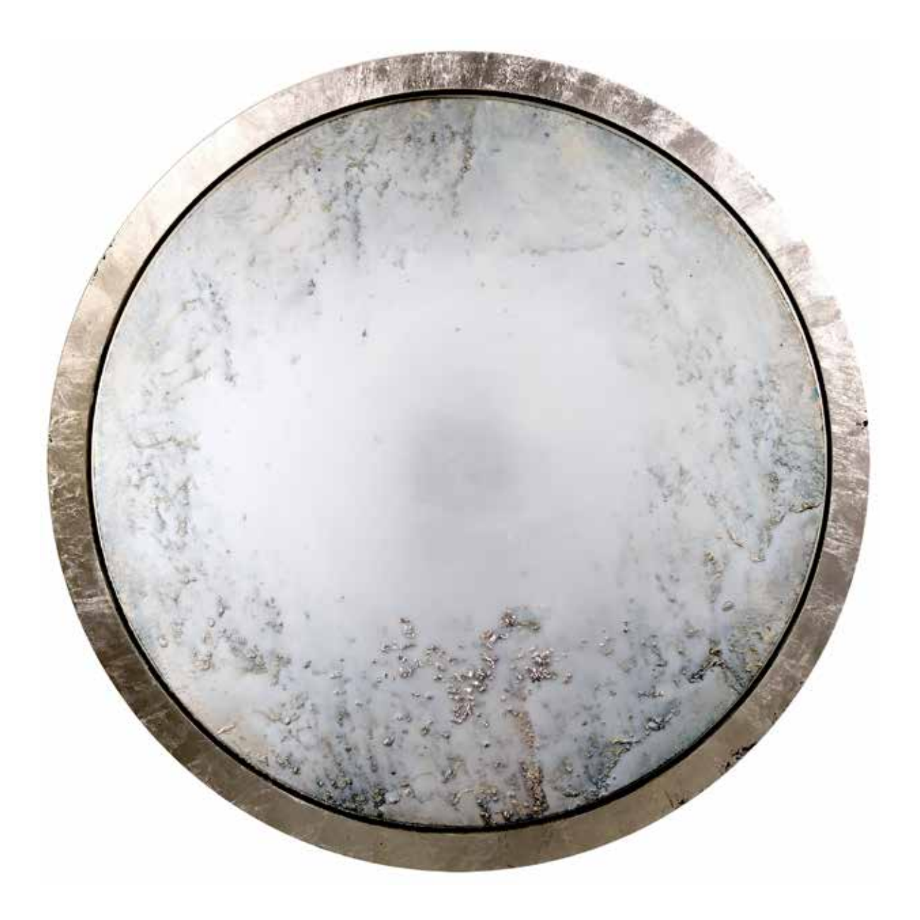
The Perfection 55 in | 127 cm