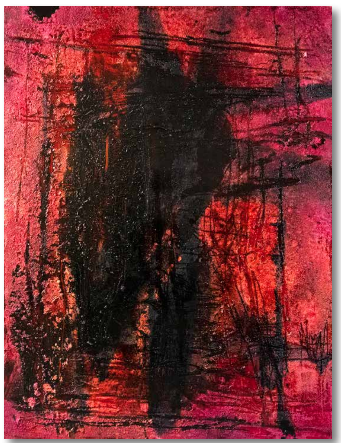
Reaching to the Other Side 88x66 in