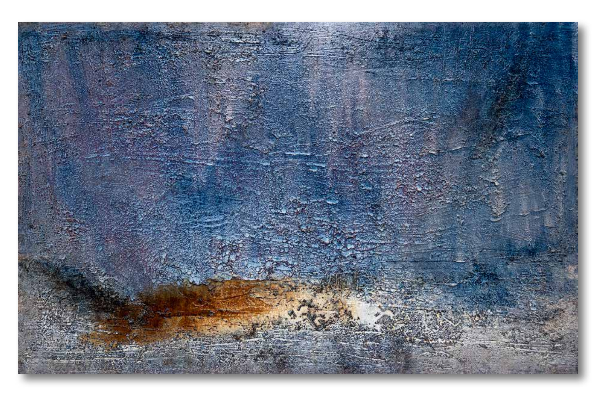
Ramas Bridge 68x108 in