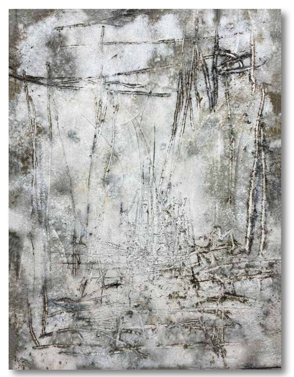
The Rheimann Hypothesis 88x66 in