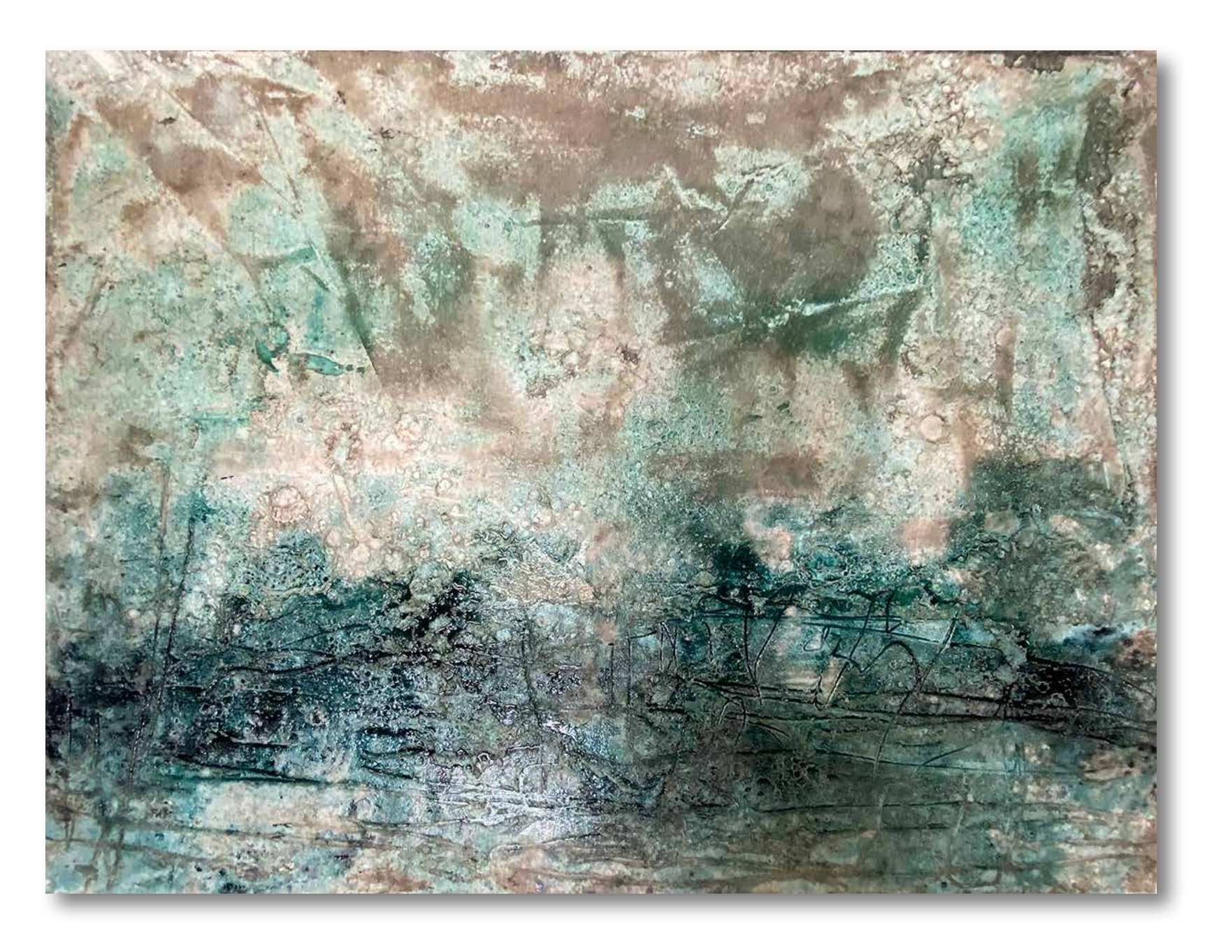
Opera Rotas 66x88 in