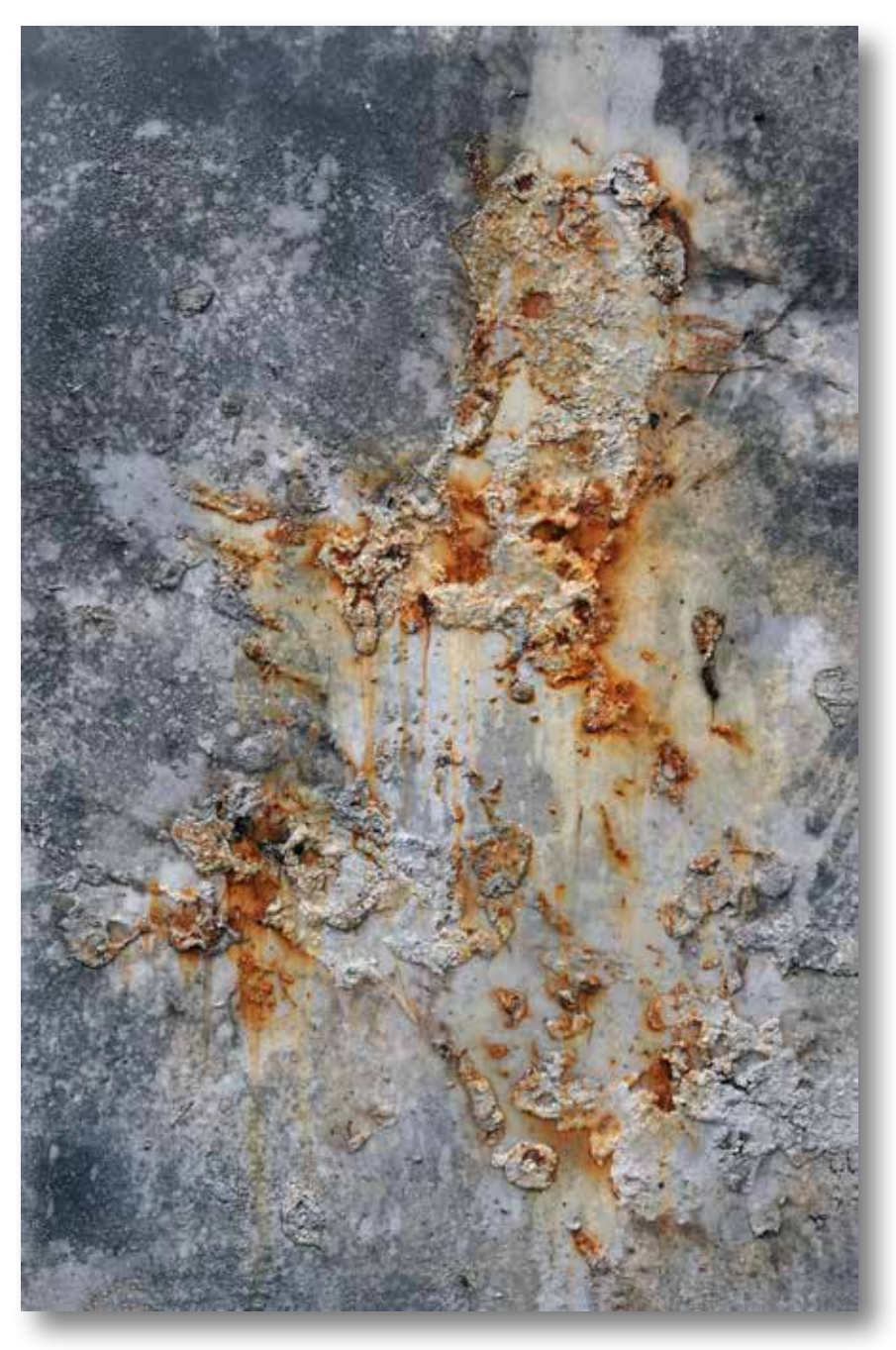
Laconia in Peloponnese 64x42 in