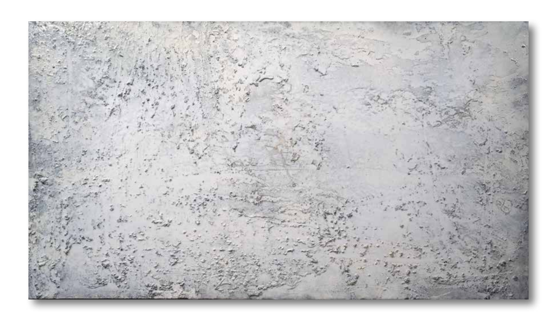
The Contemplative One 50x90 in