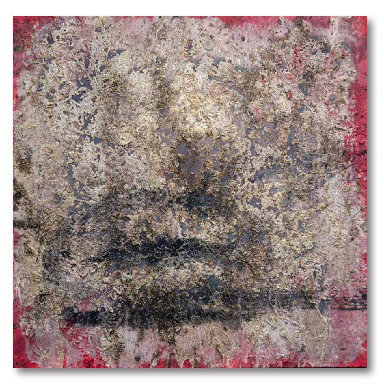
The Year of the Tiger 60x60 in