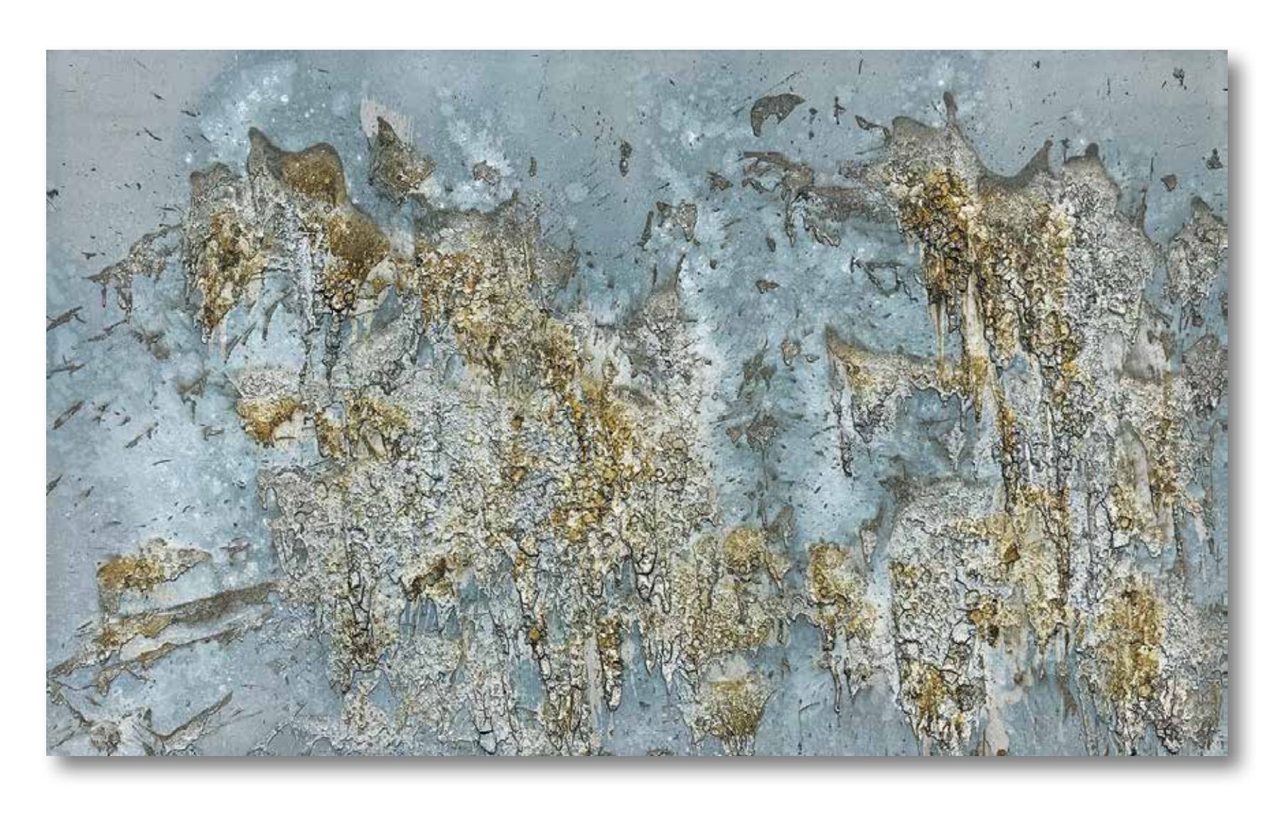
The Metamorphoses of Ovid 46x76 in