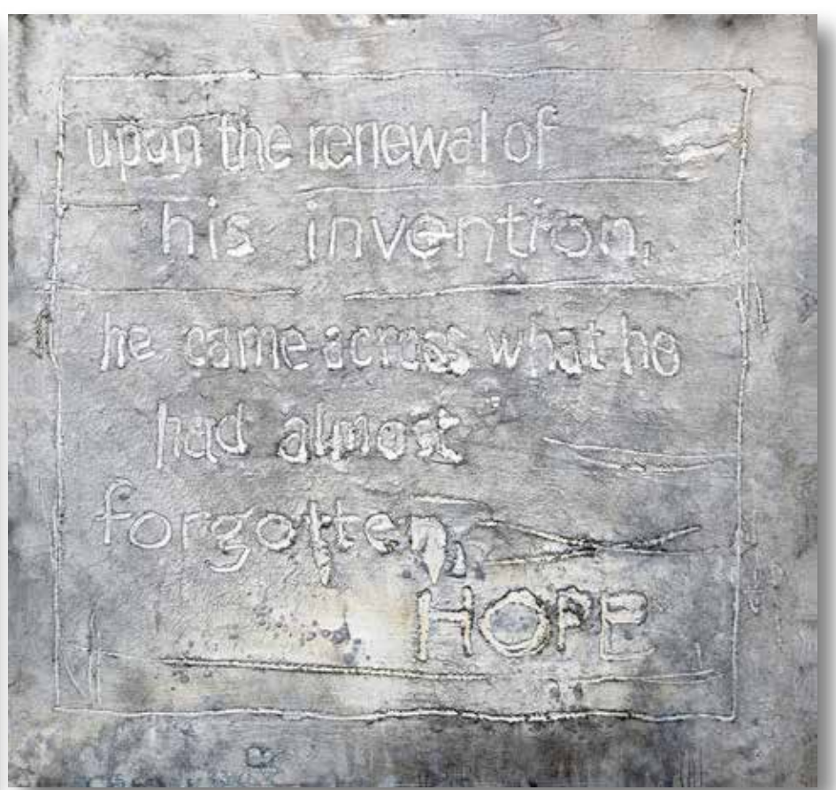
Reckless the Recluse 72x76 inches each