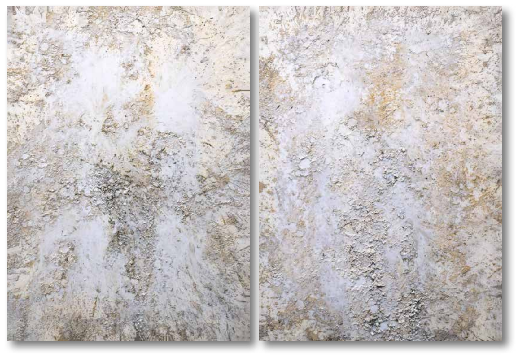
Plato's Light Part I & II 76x54 in