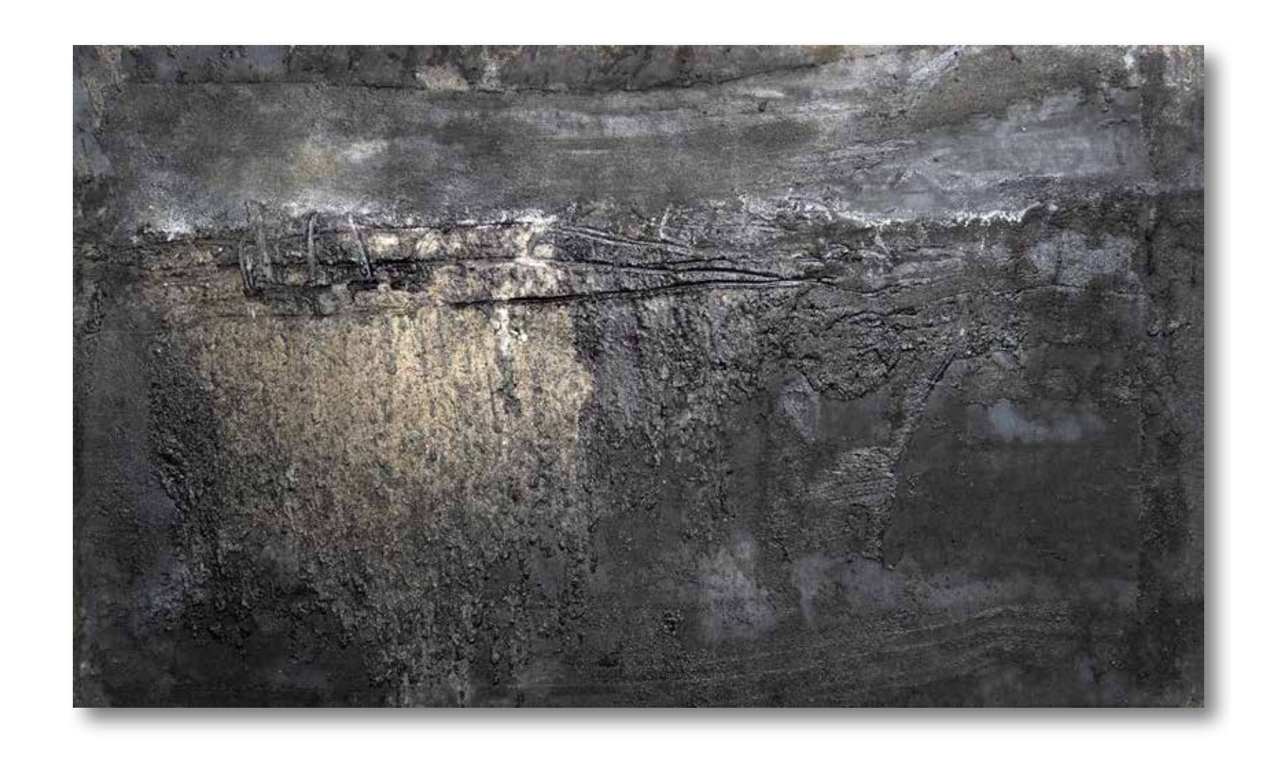
Just Across the River 36x60 in