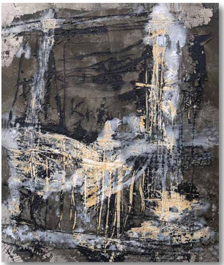
Tiriel and Urizen 65x55 inches each