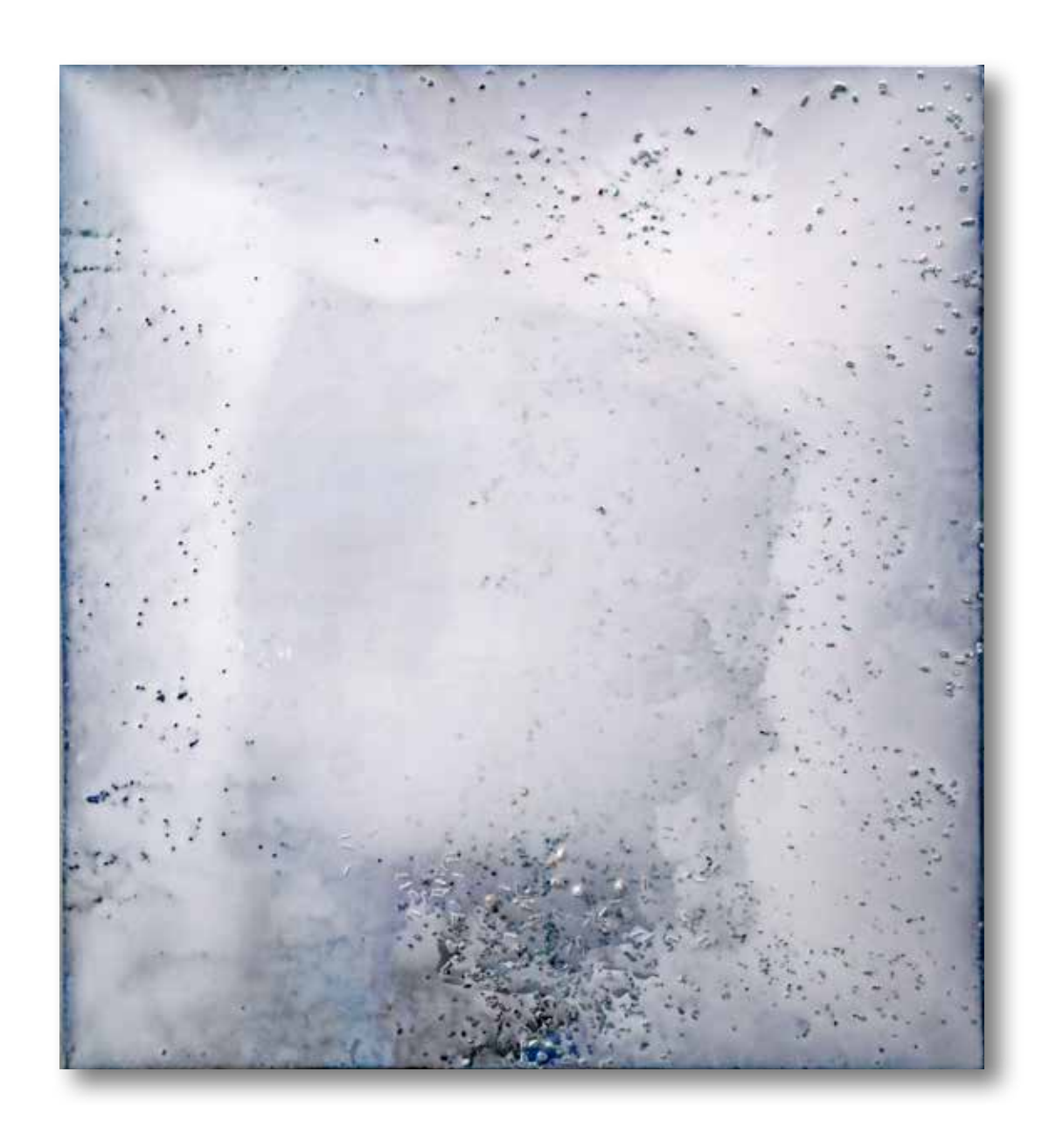
The Crystal Palace 46x42 in