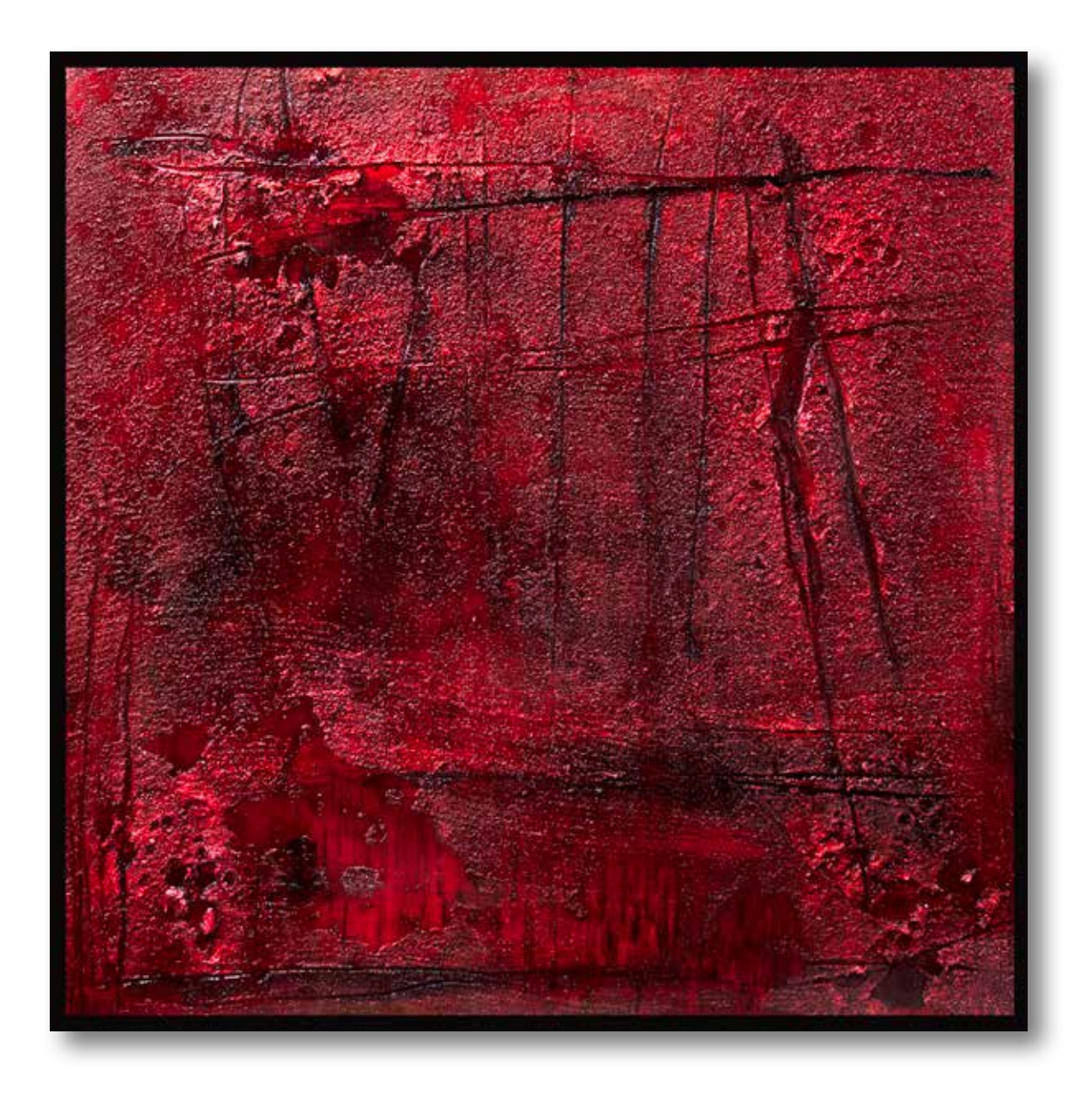
Kermes Vermilio 46x46 in