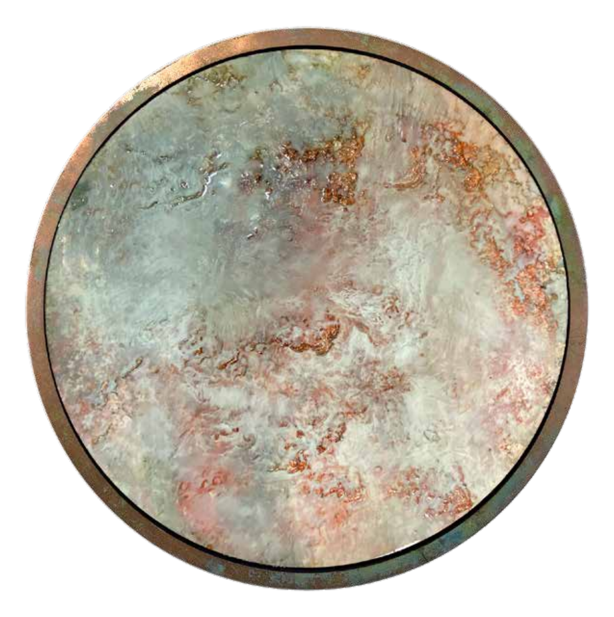
Shugi Tablet 42 inches framed