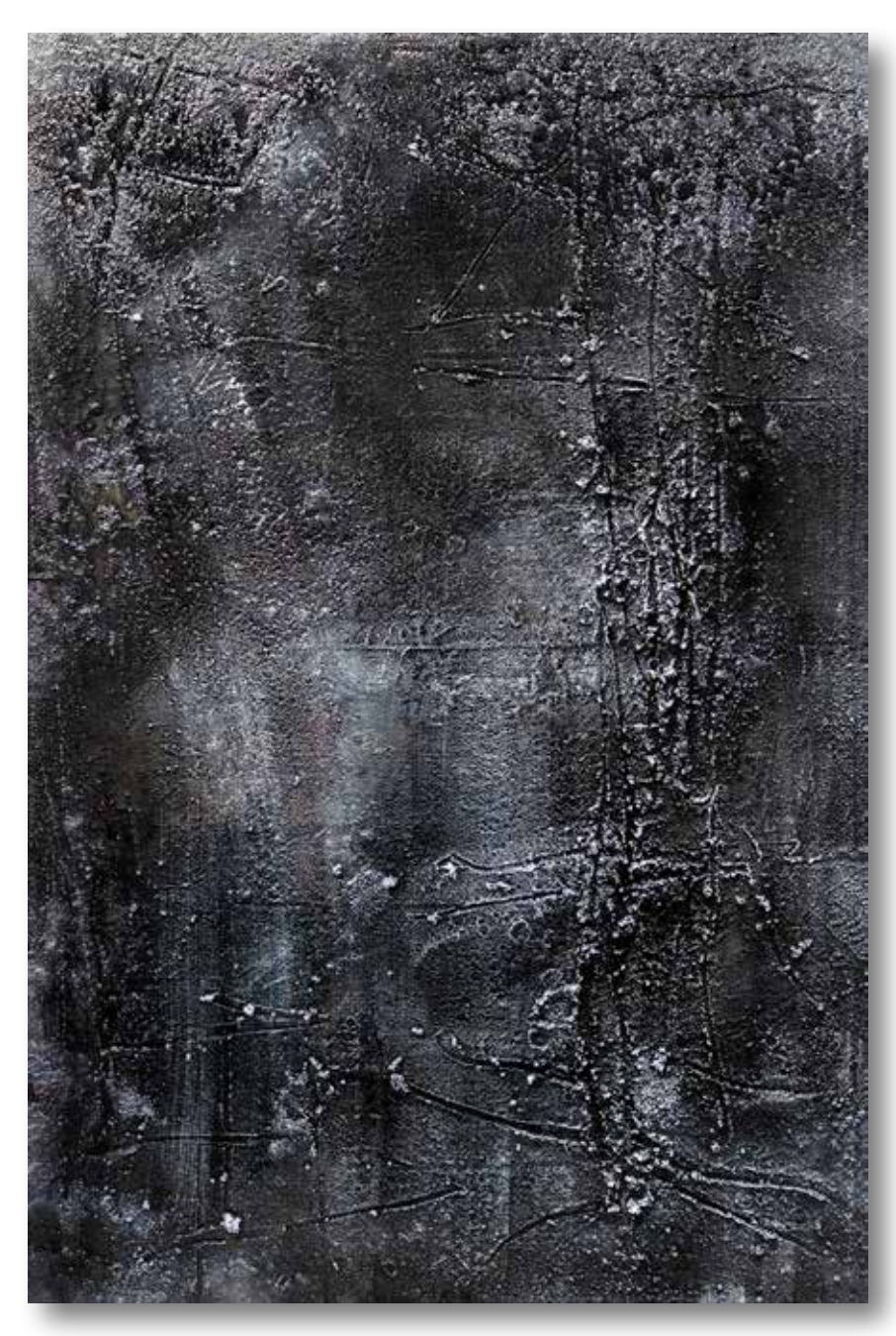
Azabache Tablet 58x38 in