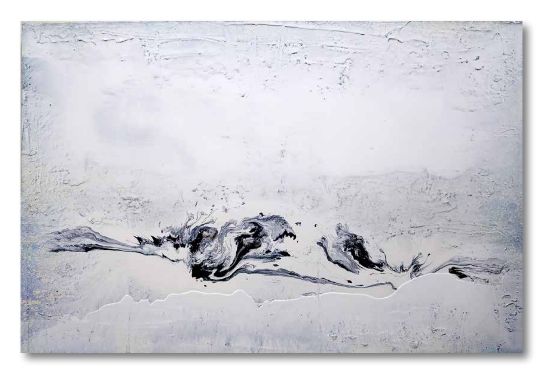
Notion of an Ideal State 60x90 in | 152x228 cm