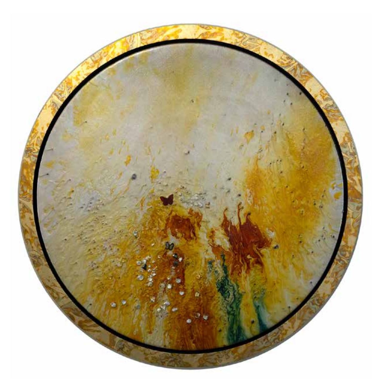
The Golden Butterfly 32 in