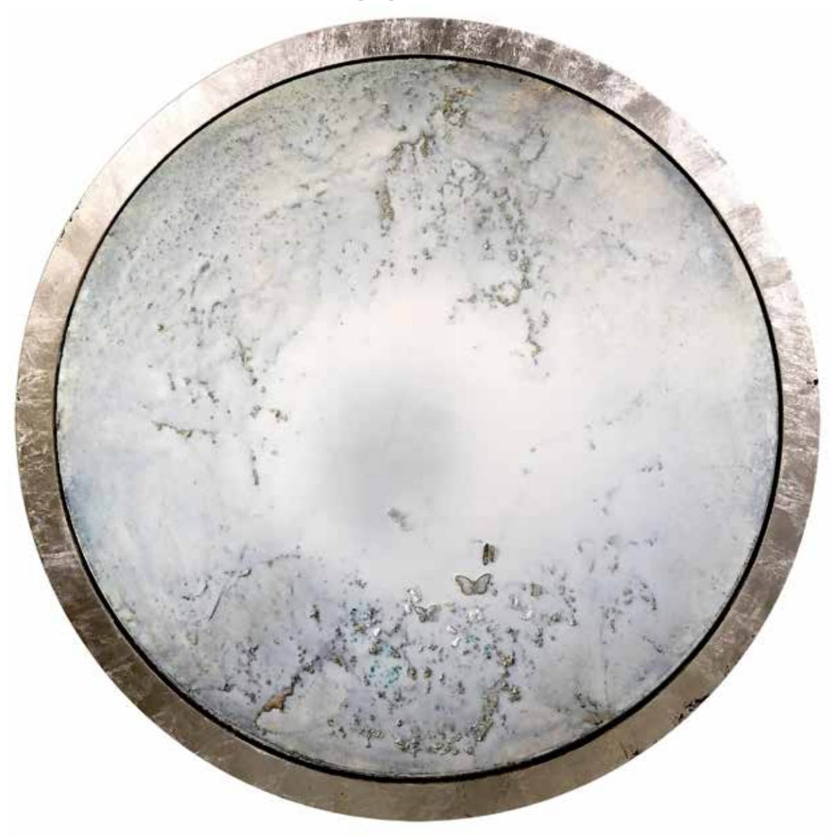
Days Past Enchanted 55 in | 127 cm