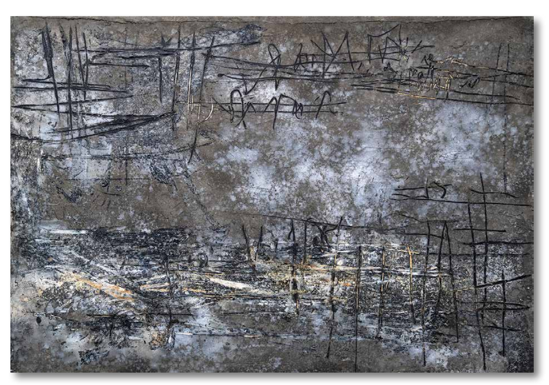
The Unsolvable Equation 70x100 in