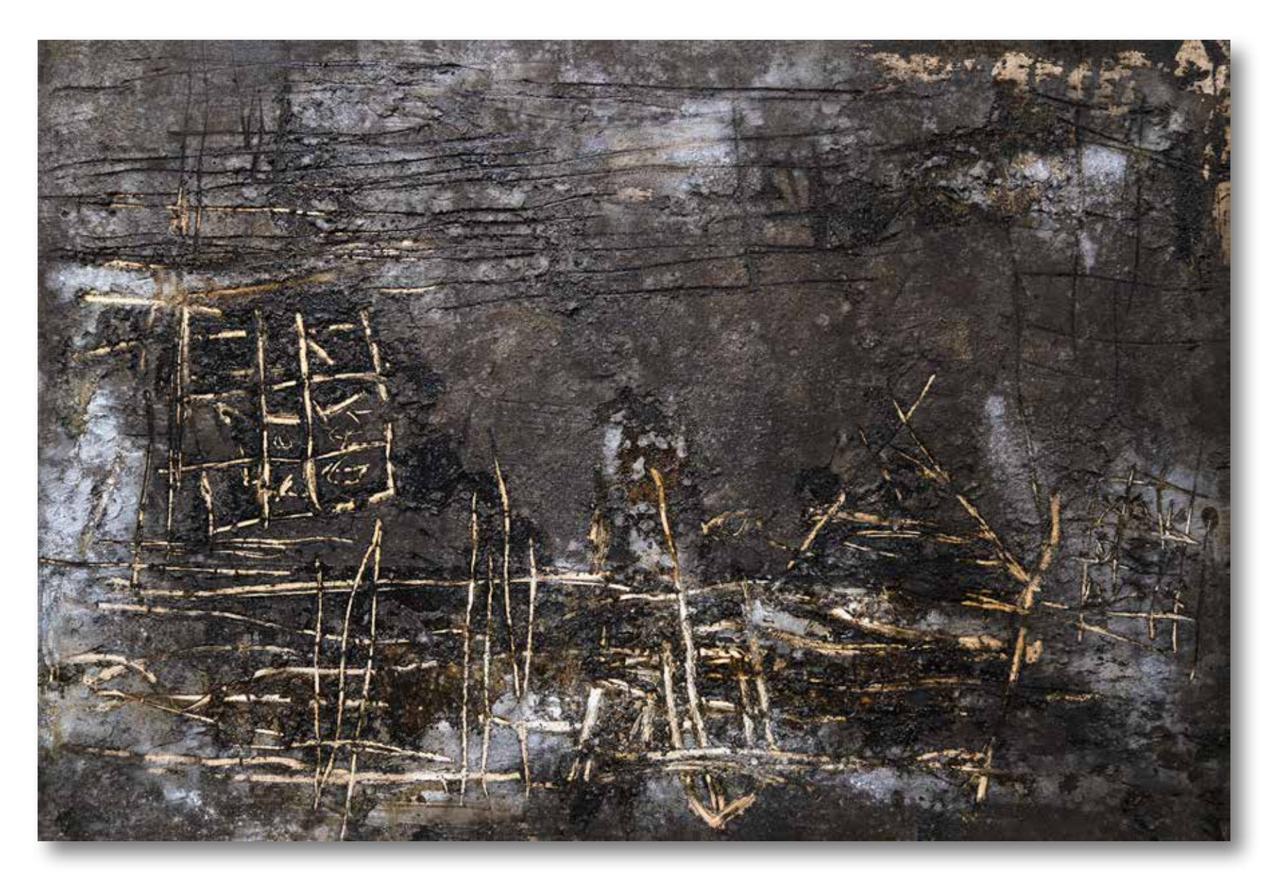
The Fisherman 60x90 in