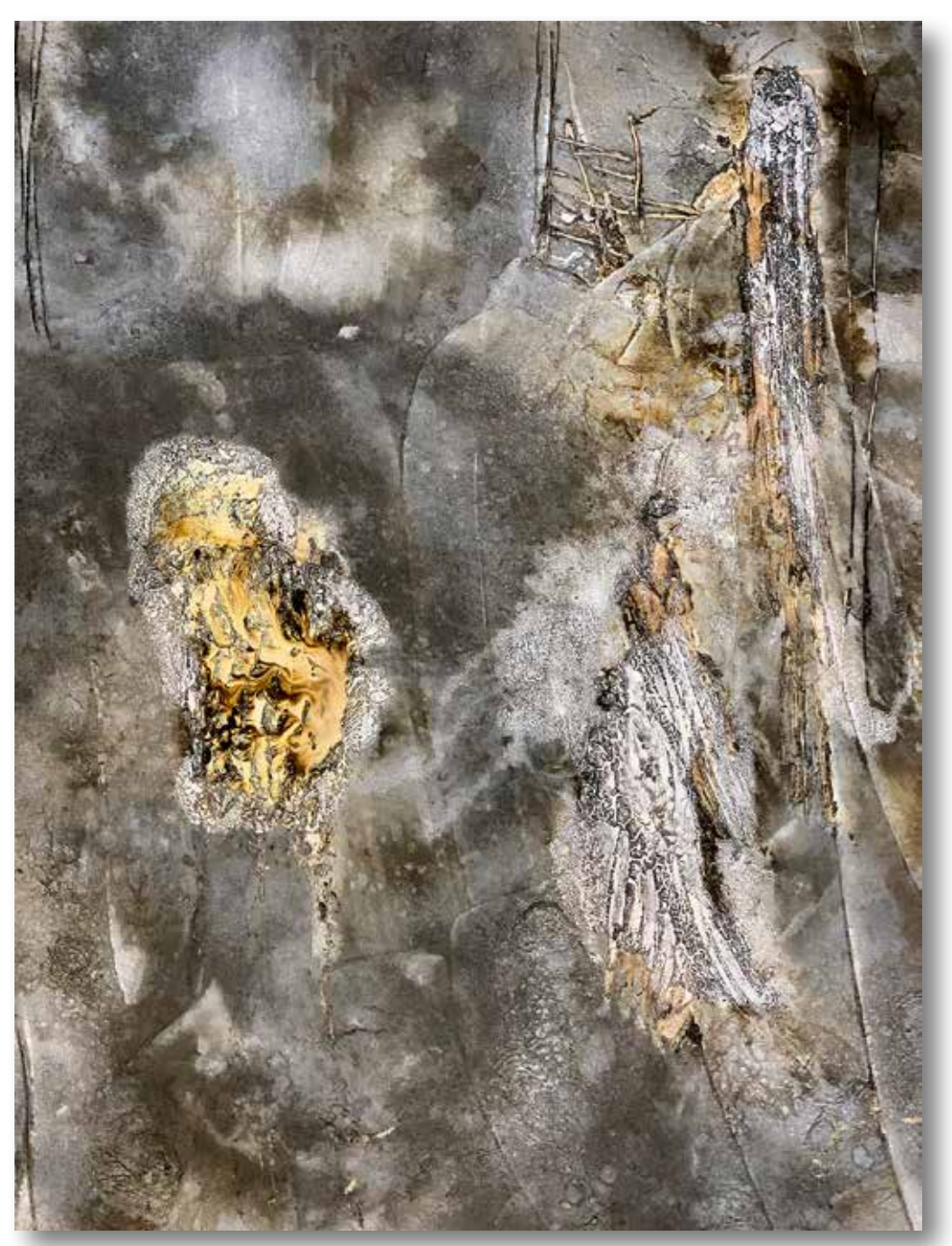
Semper ad Meliora 88x66 in