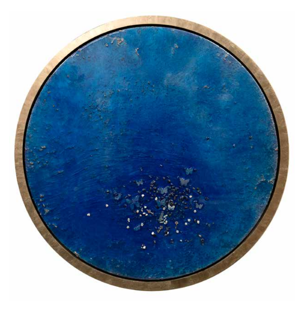
Three Treasures 42 inches framed