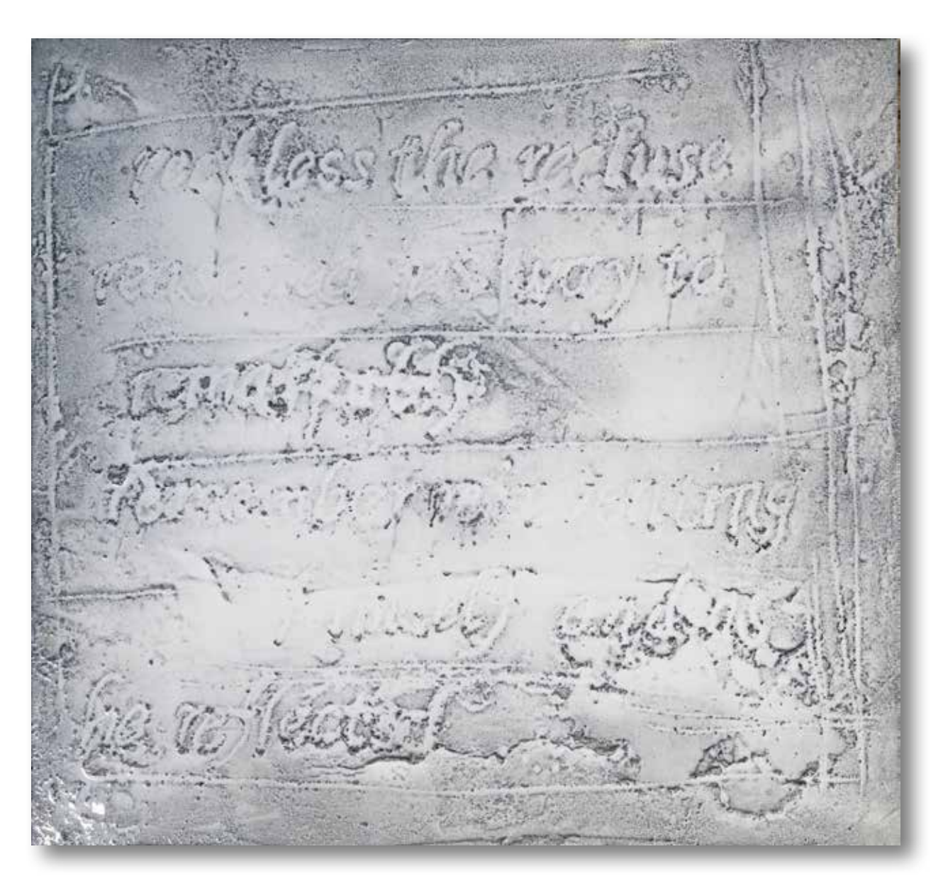
Soliloquy 43x46 in