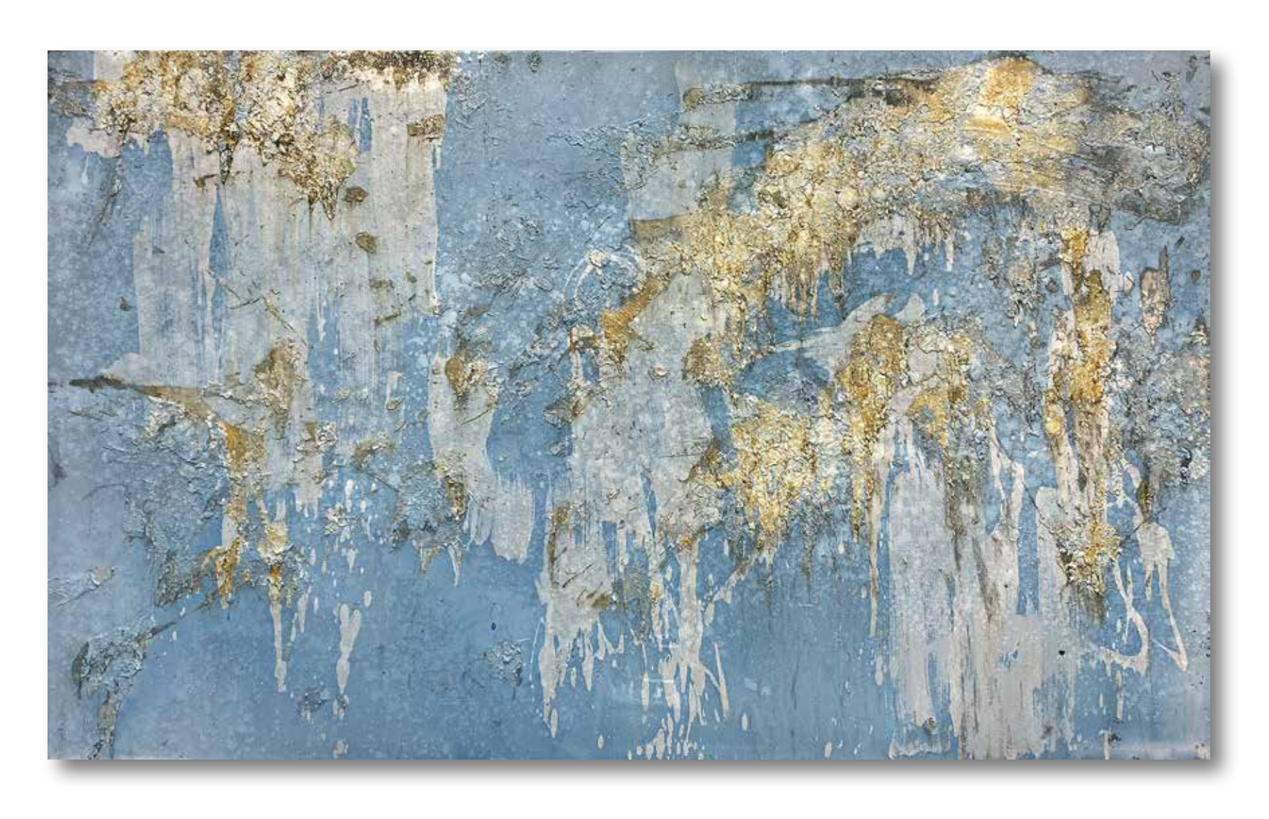
Tales from the Silk Road 46x76 in