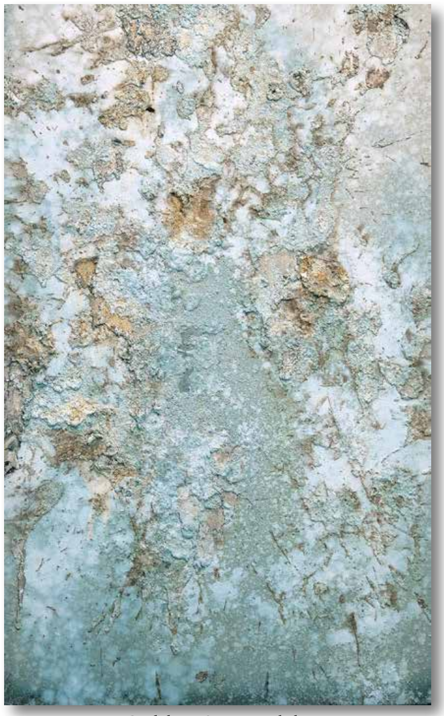
Credula est Spes Improbaba 60x36 in