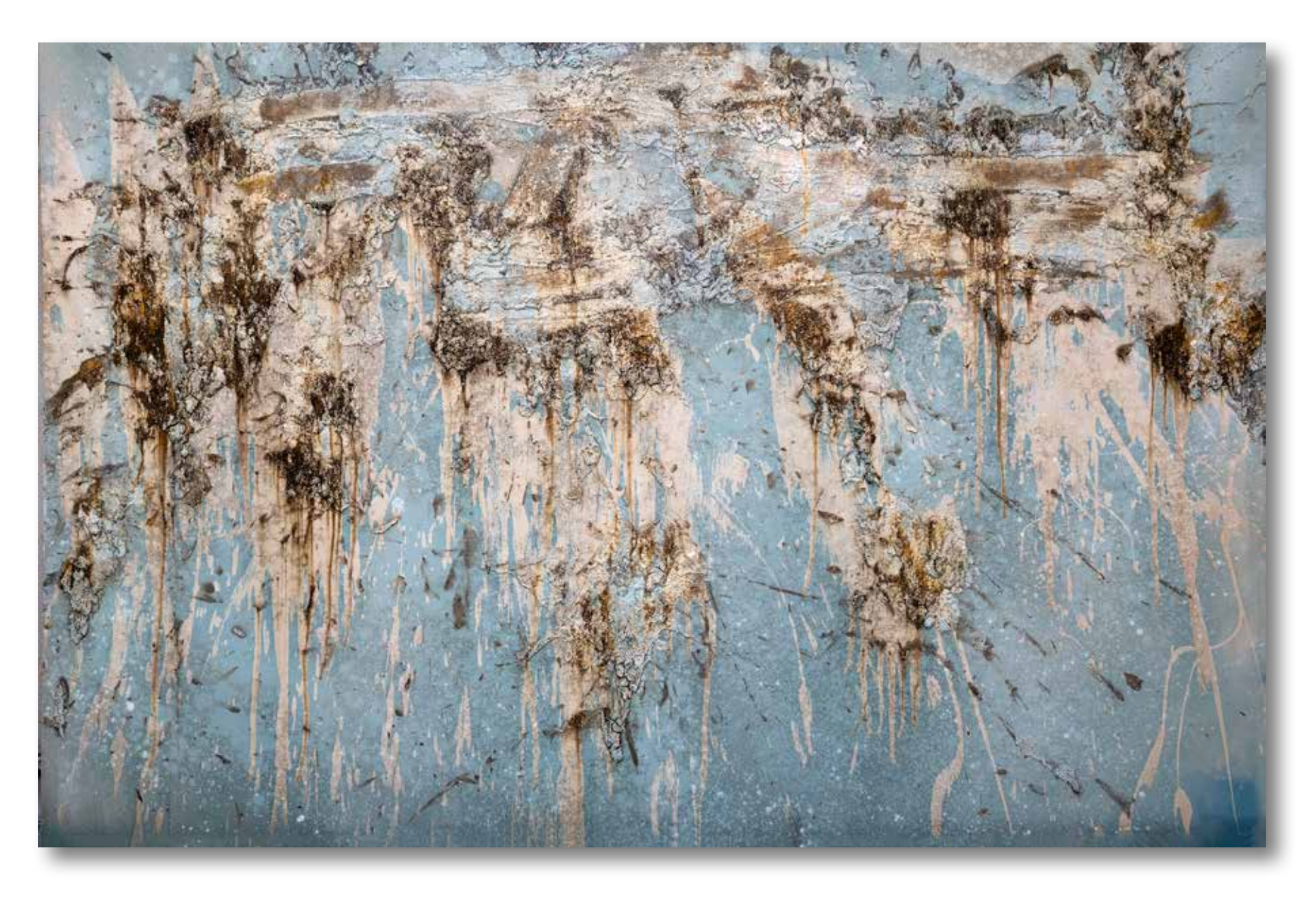
The Renaissance of Humanism 60x90 in