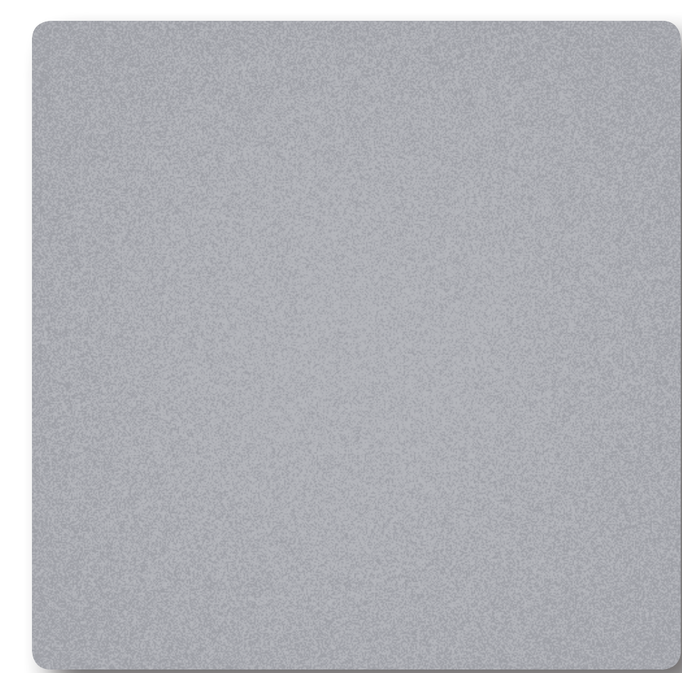
Paint Color: Metallic Silver

Note: Surfaces 60"-72" wide require a support channel