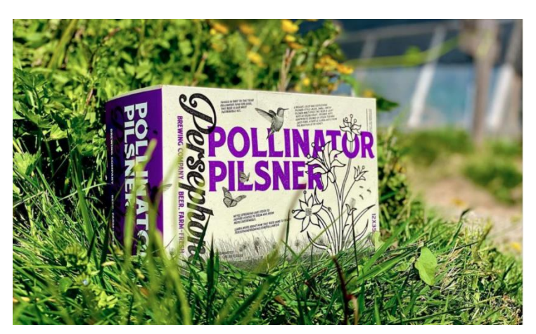
2022 NAPPC Farmers and Ranchers- Canada

Persephone Brewing Company located in Gibsons, British Columbia makes sustainable brewing and local food security a priority when crafting their award-winning beers. Persephone is a certified B-Corporation and obtained their Bee Friendly Farming Certification from Pollinator Partnership. Partnered with TELUS Agriculture, Persephone Brewing Company contributes to pollinator awareness and conservation through their mission to brew the most sustainable and traceable beer. TELUS