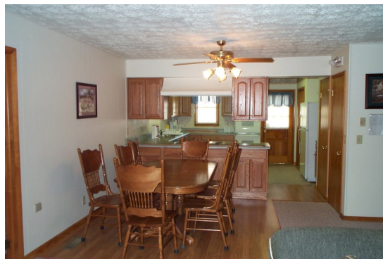
Wood St. CSU Dining Room and Kitchen facilities.

Referrals are accepted twenty-four hours a day for entry into Wood St. CSU. Intake staff will ask you a series of questions in order to determine if a child is appropriate for admission to the facility. If for some reason a child is not able to be accepted into the program, staff will assist the child and his or her family in locating alternative means of addressing the crisis situation. Please note that a parent or legal guardian must provide written consent for a child to enter into the facility. Referrals may be made by calling the unit directly at 606-564-7050.