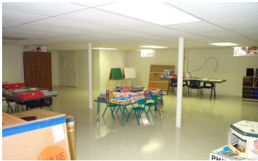
Wood St. CSU Activity and Educational Center

The CSU is a Children's Crisis Stabilization Unit located in Maysville, KY and run by Comprehend Inc. The purpose of the unit is to intervene in crisis situations in which children are at risk for placement outside of the home or placement into a psychiatric hospital. This is achieved through an