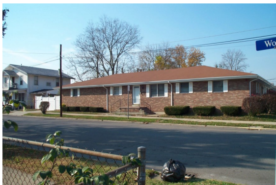
Wood St. CSU at 221 Wood St., Maysville KY 41056