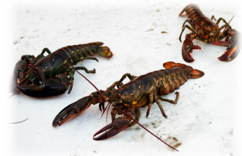
Lobster from Atlantic Ocean, Connecticut