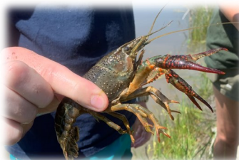
Crayfish from Plum Creek, Texas

The Guadalupe River drainage basin is 6,061 square miles in size. That is an area larger than Connecticut.