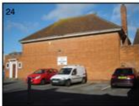
24. The Masonic Hall (right) built in 1940. Prior to that the local philanthropic Freemasons Lodge met in the Railway Hotel (High St), where it had moved from Highbridge in 1857. The Lodge is responsible for many local civic and charitable works.

Continue up Technical St and across the High St, taking the path opposite the Somerset and Dorset pub to: