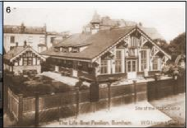
6. The Ritz Cinema. Burnham's second cinema, constructed in the 1930's and ultimately replacing the Electric Theatre / Majestic Cinema in the High St (now the 'Burnham Shopping Centre'). The Lifeboat Cafe Pavilion (above right), an annexe to the Lifeboat Restaurant (below right) originally stood on the site.