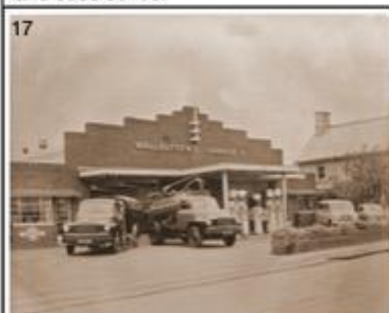
17. Wallbuton's Garage (below). From the 1930's this stood on the site now occupied by the car park. It had occupied the opposite corner of Cross St during the 1920's. Seaton House residential home was later built on the site but was demolished soon after due to land subsidence.