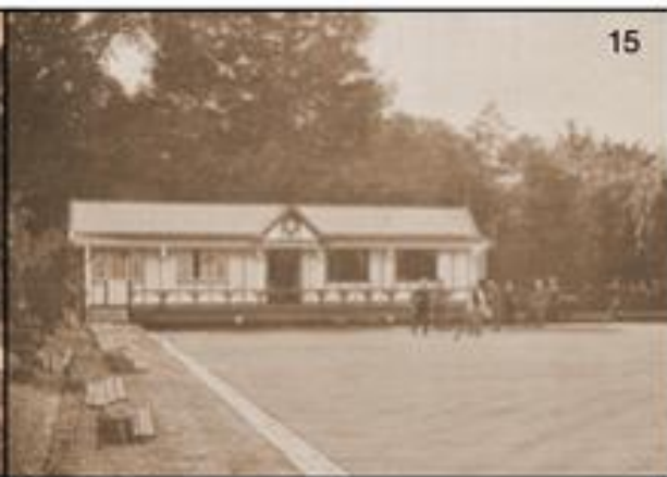
15. The Bowling Green, with its entrance on St Andrew's Rd, was developed on part of the Manor Gardens during the early 20th century (above right)