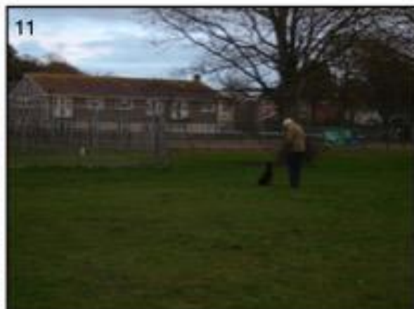
11. Putting Green, Crosses Pen. We do not know when this area next to The Manor Gardens was first laid out for public amusements. The picture above left appears to be from the 1940's or 1950's and shows both miniature golf and tennis courts.