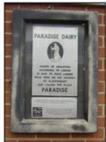
8. Cross over Berrow Rd and walk back towards Burnham. Near the corner of Shelley Drive is a plaque marking the site of the Paradise Dairy.