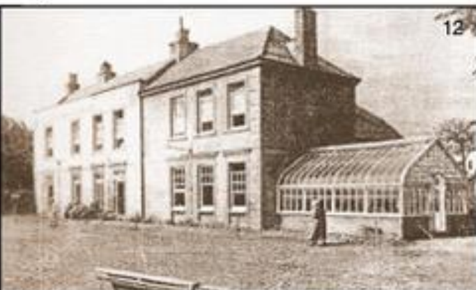
12. Across the road is the Community Centre. This was once known as 'The Hall'. Built in the 1820's on land acquired by the Bishop of Rochester, which included the Crosses Pen land. The mineral springs for the spa (Trail 1 No 15) were found in the kitchen garden (now the rear car park).