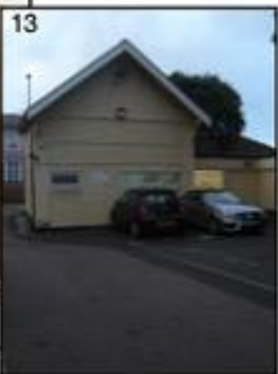
13. This building, previously the Tourist Information Centre, was home to an open air theatre during the first half of the 20th century (far left). It was entered from Manor Gardens with seating on the present car park. Many seasonal concert parties played there.