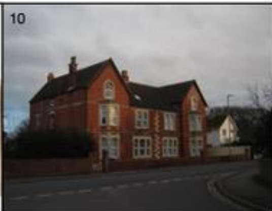
10. Returning to the bottom of Sea View Rd you will find the old Oakover School building on your left. Established in about 1888 as a girls day and boarding school, later co-educational. Now private residences.