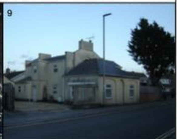
9. Lucerne Cottage was built by George Reed in 1842 and developed as a Tea Garden with a maze, hence it became known as the 'Puzzle Garden'. Now a private residence. Newer houses to its right were built on the maze grounds.