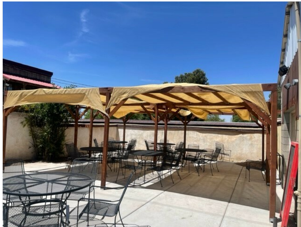
back patio pergola