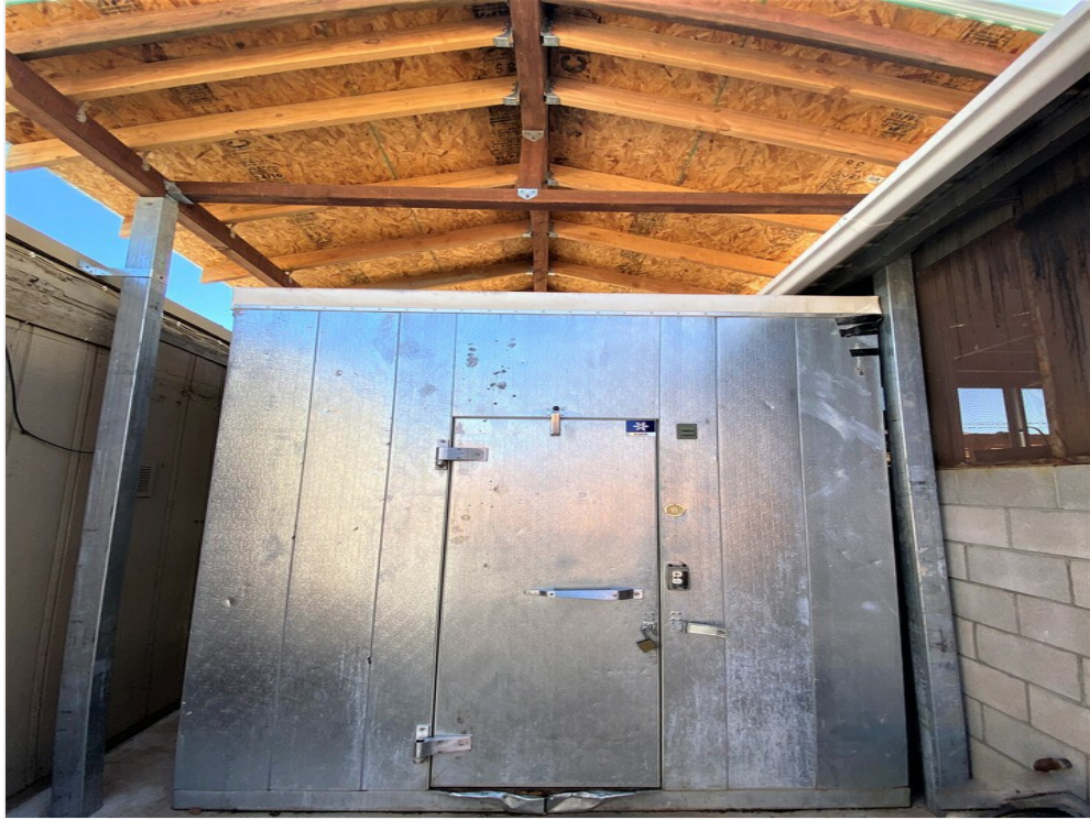
9x9 Walk in Cooler