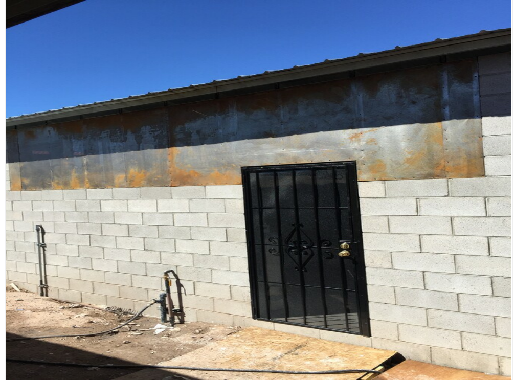
20X20 smoker bldg.