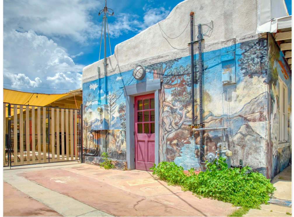
Mural on side of bldg