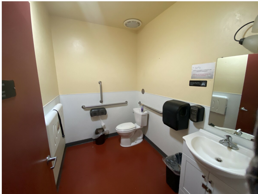
2 of 2 ADA Bathrooms