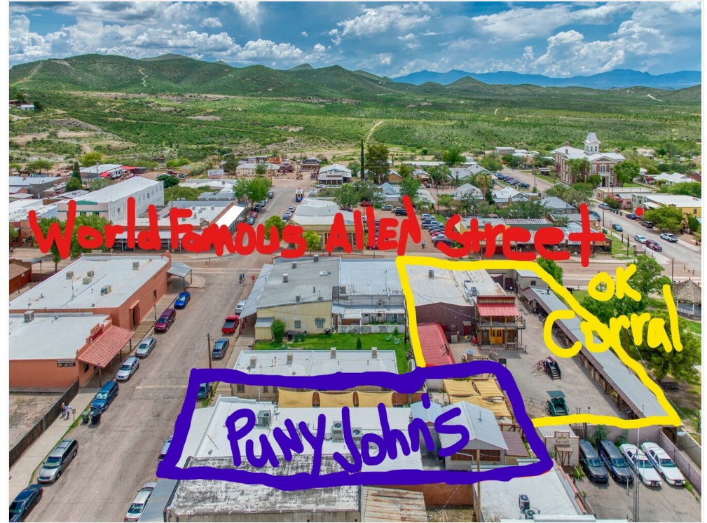
Just feet from MAJOR TOMBSTONE attractions