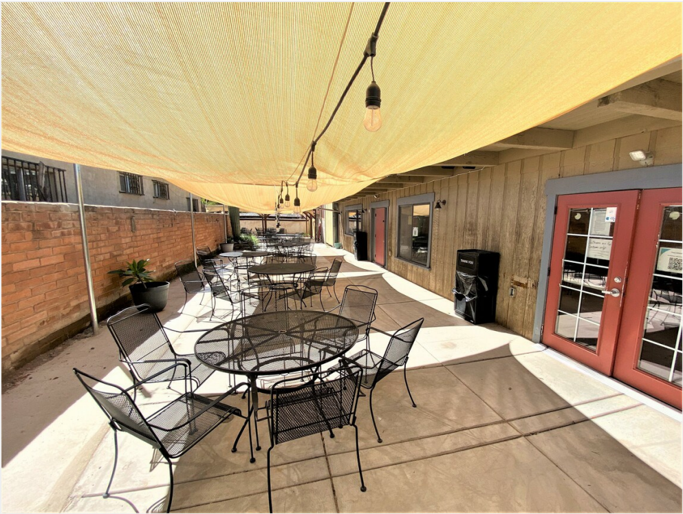
Covered Outside Seating