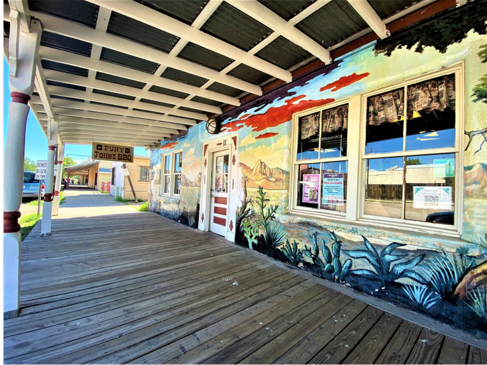
Front covered porch entry