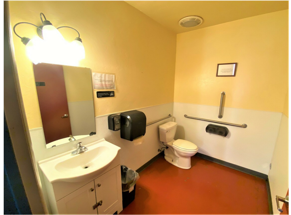
1 of 2 ADA bathrooms