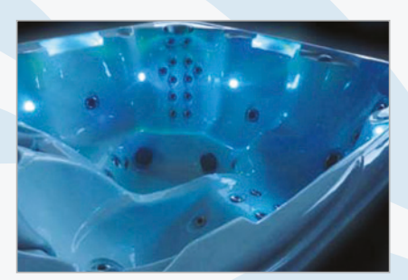
Rail light * not available on 743D & 627M