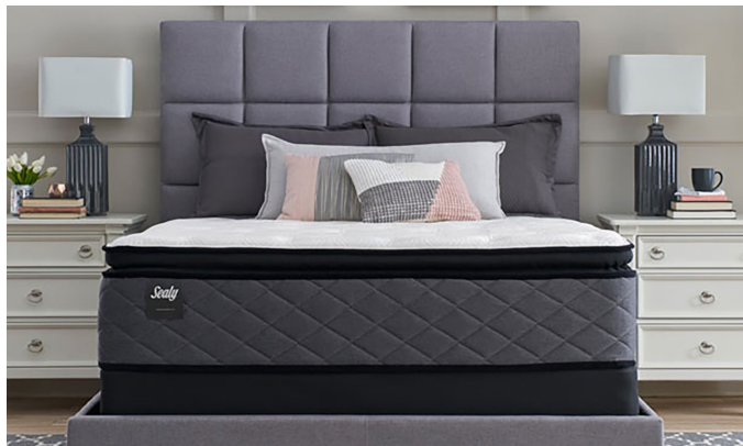
Right: Coaster Fine Furniture, Kith, Affordable Furniture MFG, Sealy