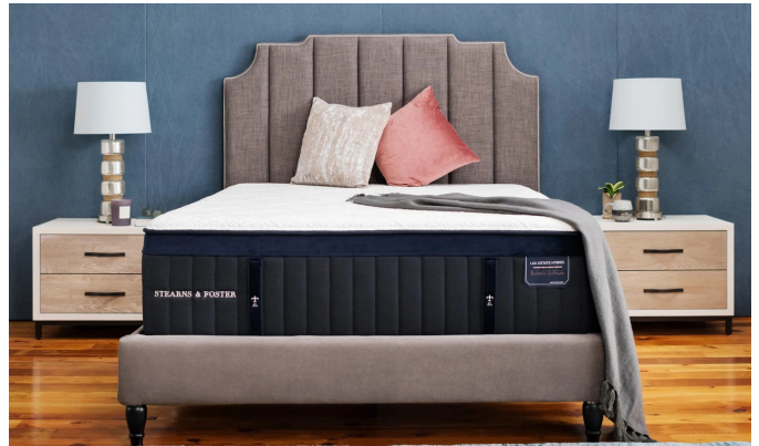
Top to Bottom: Behold Home, Stearns & Foster, ACME Furniture, AA Importing