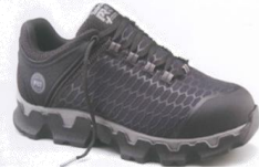
Steel Safety Toe Powertrain Sport