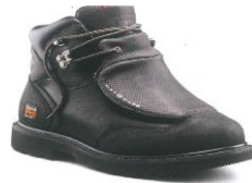
6" Steel Safety Toe Black Full - Grain Leather with Ever - Guard Leather