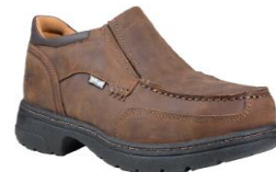
Tech Sheet International - Branston Moc Toe ESD Alloy Toe Steel Plate