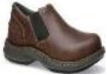
Gladstone Steel Safety Toe