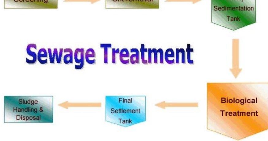
Fig.3. Sewage treatment steps

Primary treatment- physical removal of small and large particles through filtration and sedimentation begins the process of primary treatment. Firstly, sequential filtration removes debris. Then sedimentation removes the soil and small pebbles. The left over known as effluent is taken for secondary treatment.