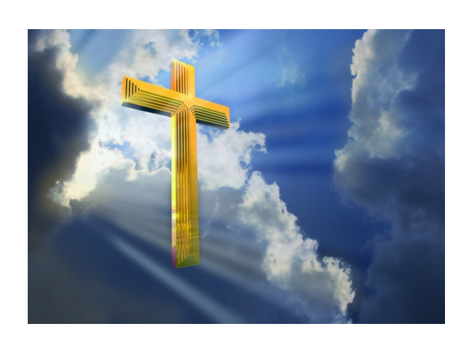
IN THE BEGINNING GOD CREATED