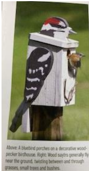
Above: A bluebird perches on a decorative woodpecker birdhouse. Right: Wood saytrs generally fly near the ground, twisting between and through grasses, small trees and bushes.

For Line Dancing classes, etc., check bfcommunityclub.org .