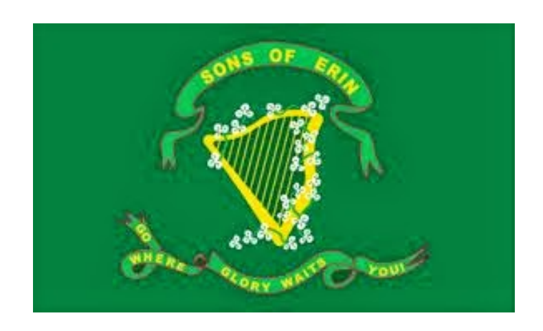
Sons of Erin Confederate Irish Flag

This is a flag of the 10th Tennessee Regiment. Because of the large number of Irishmen in the unit the 10th was called the Sons of Erin (Erin meaning Ireland). It was called the Bloody 10th because of its casualties at the Battle of Ft. Donelson, about 50 miles northwest of Nashville. It fought to the end of the war, engaging in many brutal battles including Vicksburg. This flag was sewn by the Ladies Soldiers Friend Society of Nashville. It was green and gold, with an Irish harp. It has the embroidered words "Sons of Erin" and "Go Where Glory Waits You."