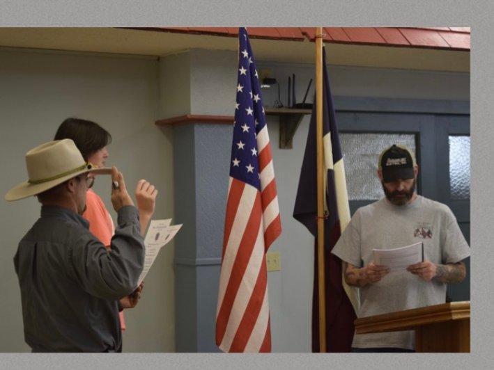
Official swearing in of ......