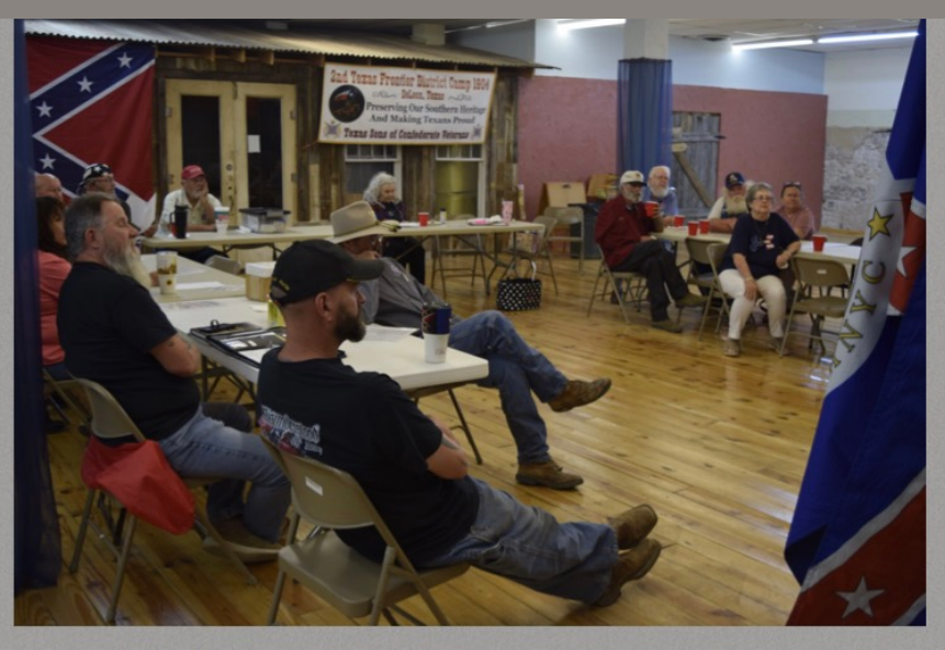
August 2023 Meeting