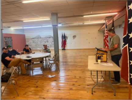
April 2025 Meeting