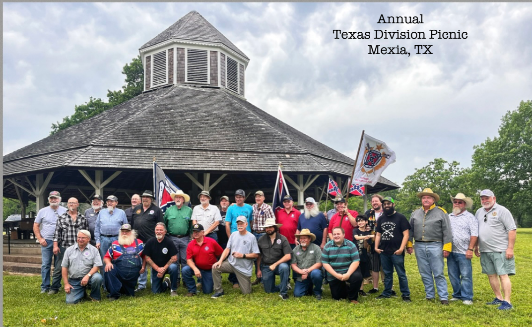
Annual Texas Division Picnic Mexia, TX