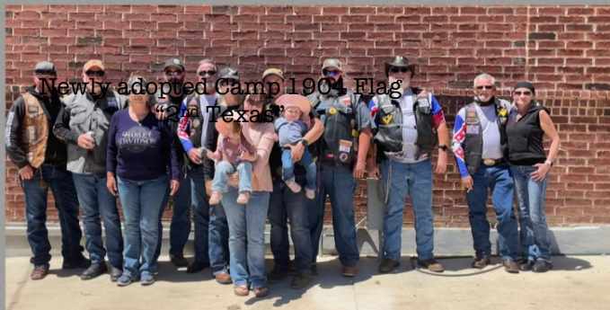
Newly adopted Camp 1904 Flag "2nd Texas"