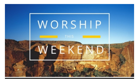
Sunday, October 18<sup>th</sup> Worship online 10 AM on