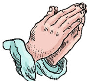
National Day of Prayer

PRINCE OF PEACE LUTHERAN CHURCH FREEPORT ROAD