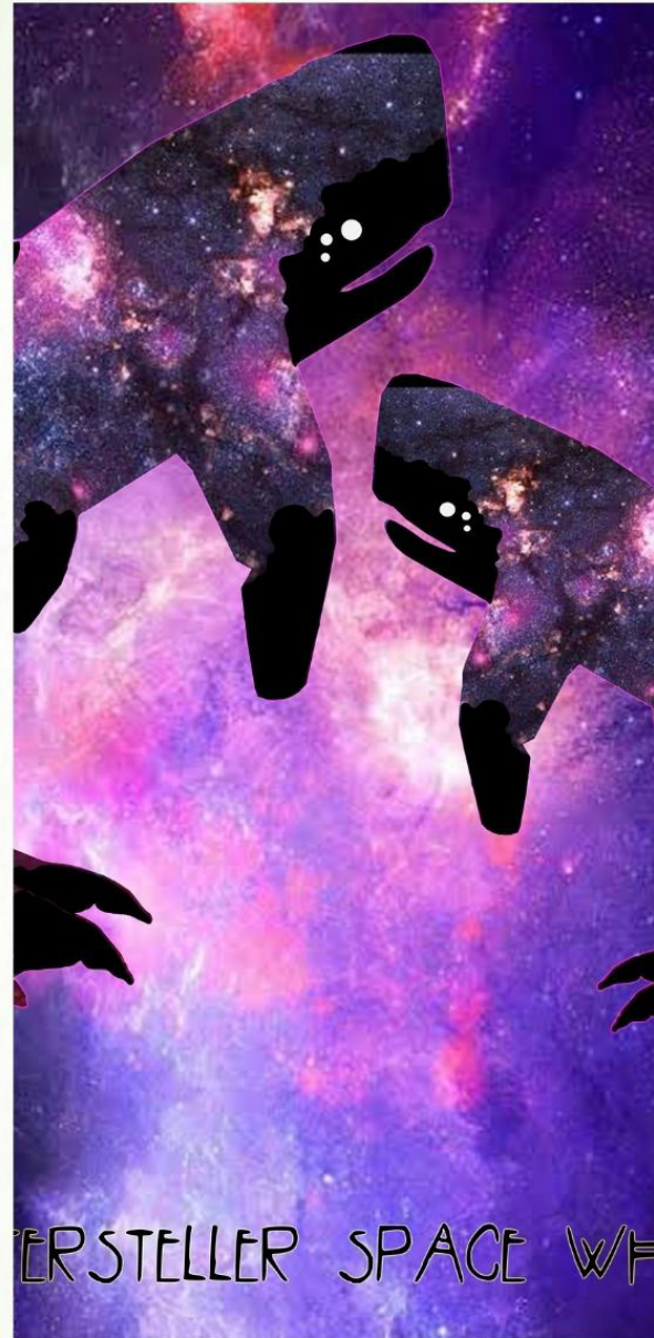
Gavyn loved art, photography, to draw and create digital art. These are a few of his works.