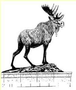
Moose Live Wire

Moose Fraternity Supports children, seniors And our community While enjoying life