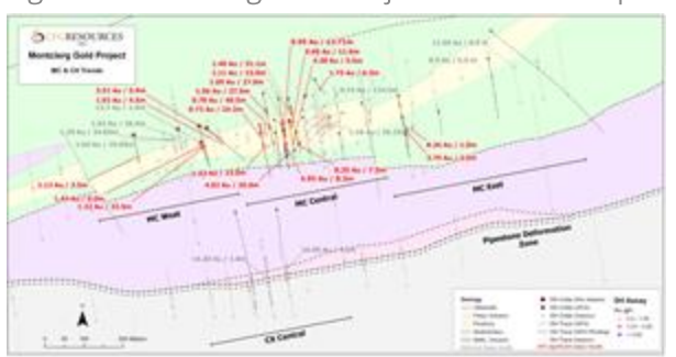
Figure 2: Montclerg Gold Project Plan View Map

Regional Map of GFG Gold Projects in the Timmins Gold District