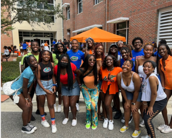
ASU X JAMSA TAILGATE 9/17