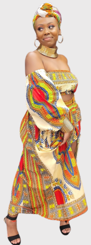
MICHELLE AT SHOWCASE 2022