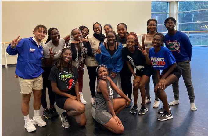
ASU MENTORSHIP ZUMBA CLASS 9/21