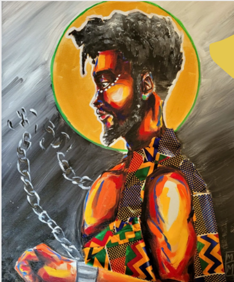
"EMANCIPATION OF THE SPIRIT" BY MICHELLE MULI

FOLLOW MICHELLE'S ART PAGE ON INSTAGRAM FOR MORE ART CONTENT: @_CHELLE_PAINTS_