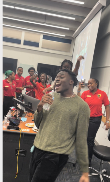
GBM #1 9/10