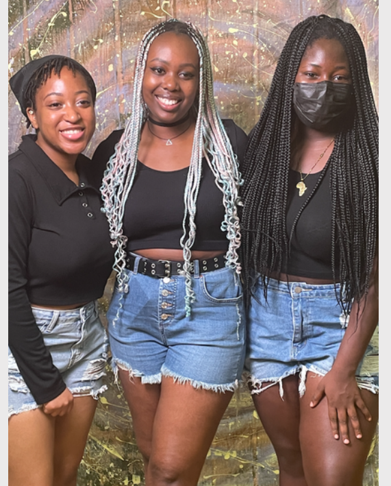
ASU DANCE TROUPE PERFORMANCE AT THE GREATER GAINESVILLE INTERNATIONAL FESTIVAL 9/18