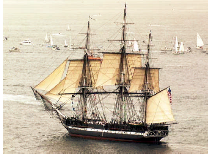
USS Constitution underway on her own sails for the first time in 116 years, July 1997

Oh, better that her shattered bulk Should sink beneath the wave; Her thunders shook the mighty deep, And there shall be her grave; Nail to the mast her holy flag, Set every threadbare sail, And give her to the god of storms, The lightning and the gale!