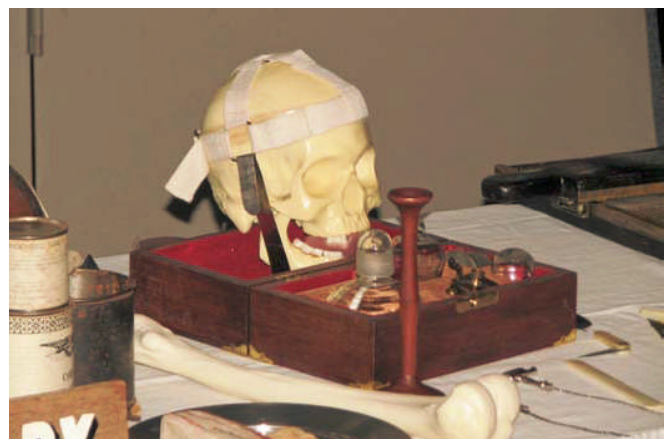
This poor fellow seems to have come out on the short end of the stick. He does seem oddly happy about it though. The lesson here is; in a crisis it's important to keep your head!