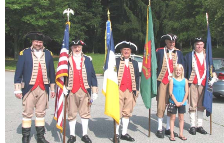
Fueling the Furnace ceremony at Hopewell Furnace National Historical Park With assistance from the Philadelphia Continental Chapter Color Guard August 1, 2009