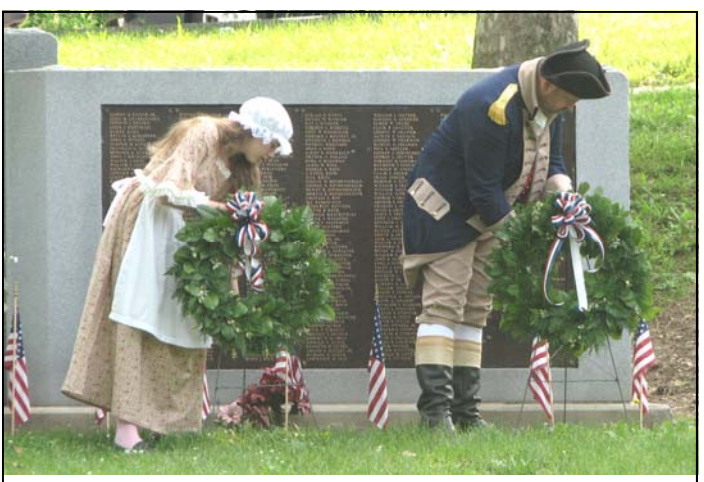
Memorial Day Ceremony in City Park, Reading May 25, 2009.