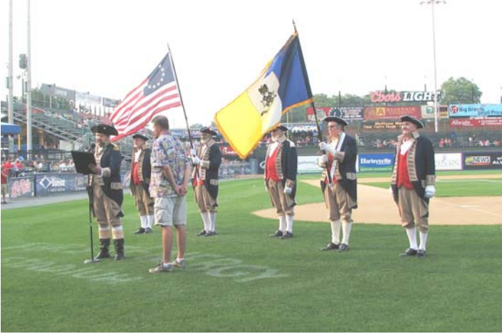
Reading Phillies The Color Guard came out in force to add some color to a Flag Certificate presentation honoring the organization for properly flying the flag everyday of the year. August 4, 2009