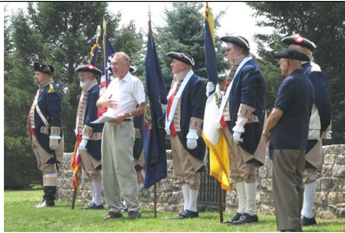
Levan Family Graveyard Dedication sponsored by the Berks County Graveyard Preservation Association July 25, 2009