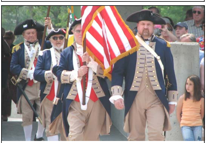
Memorial Day Ceremony at Indiantown Gap National Cemetery - May 24, 2009 Presented the Colors in front of over 5,000 people with reinforcements from the Philadelphia Continental Chapter Color Guard