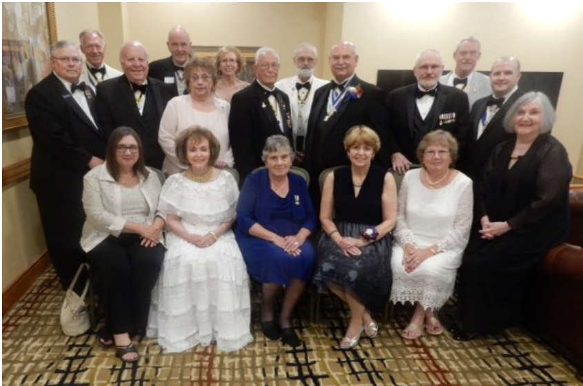
Pennsylvania Compatriots and their Ladies take time before the black tie banquet to pose for a picture.