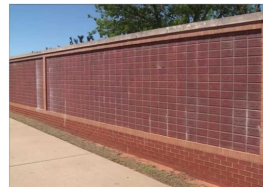
Please Note: The picture shown is NOT the actual wall.