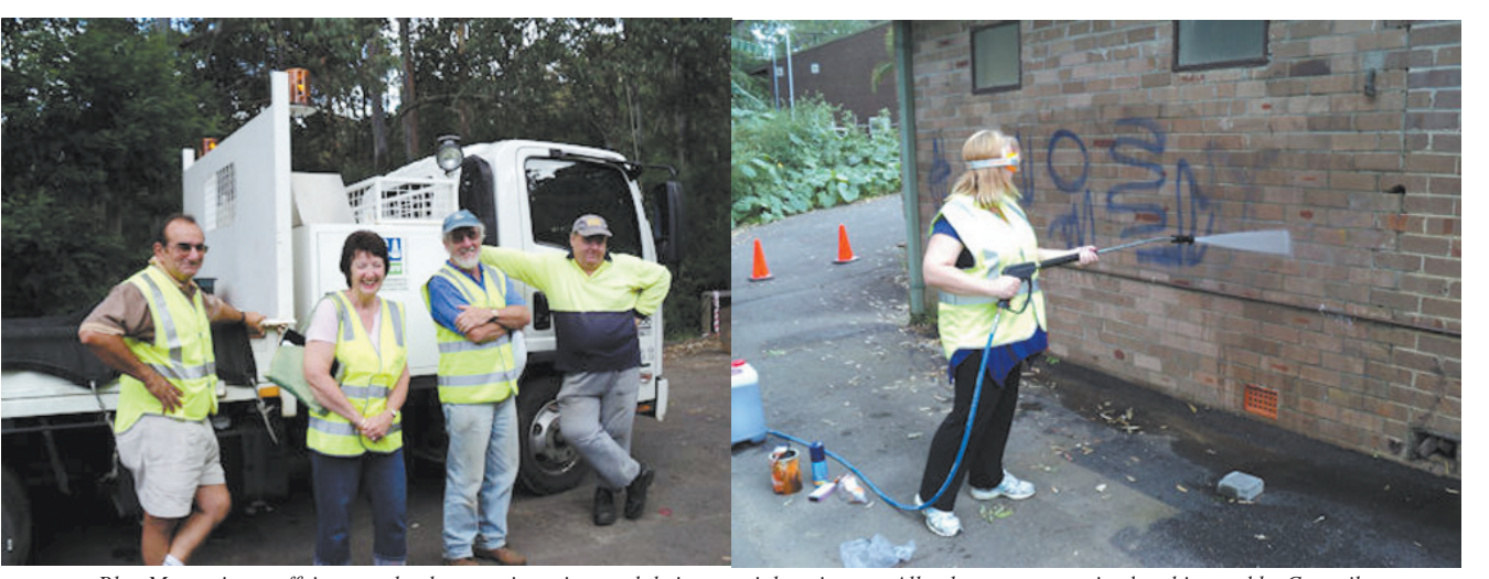
Blue Mountains graffiti removal volunteers in action, and their essential equipment. All volunteers are trained and insured by Council.

"Previous estimates of the cost of graffiti vandalism across Australia, such as the often cited $260 million, is clearly a gross underestimation, when the true costs to the community are taken into account."