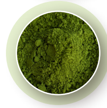
Green Tea Powder