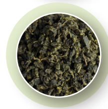
Green Tea Leaves