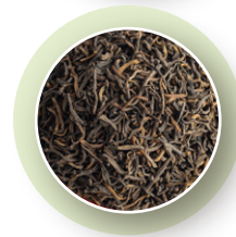
CTC Tea Leaves