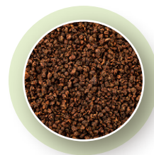
CTC Tea Granules