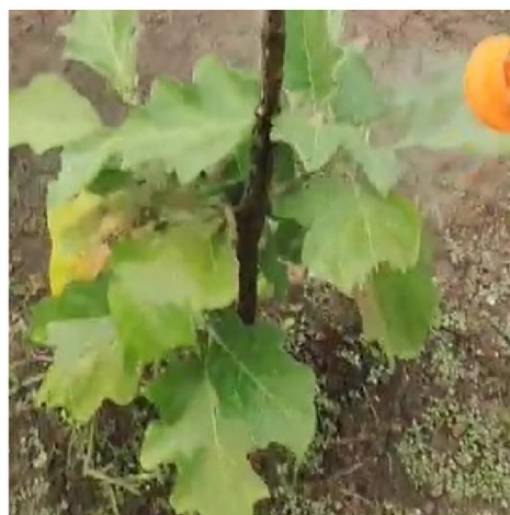
4 th Day After Spray

Results:- Red Ant & Fungus issue after 1 st spray & plant started regrowing, 2 nd spray eliminated all issues & growth boosted.