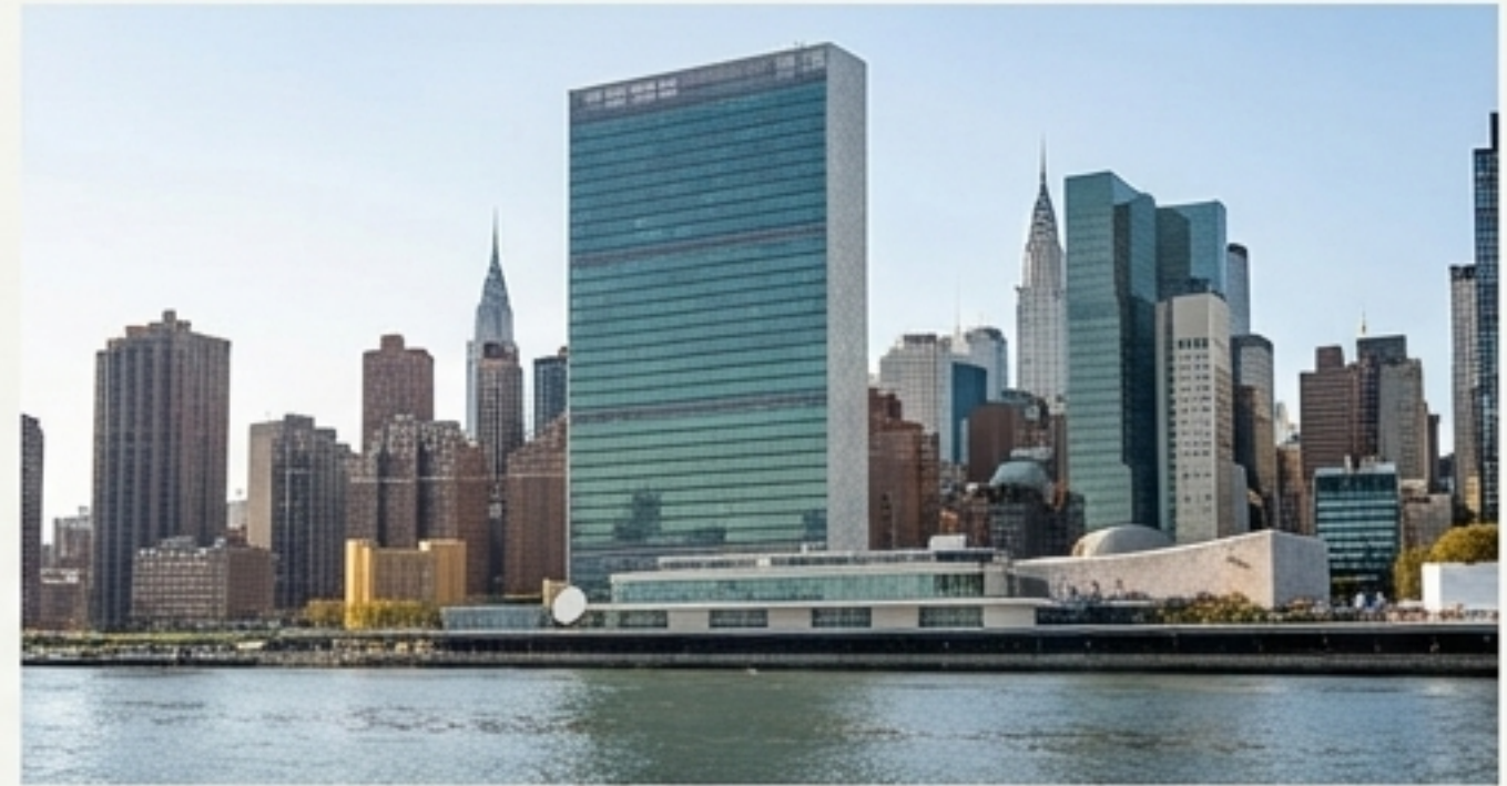
A symbol of global diplomacy on the East River.