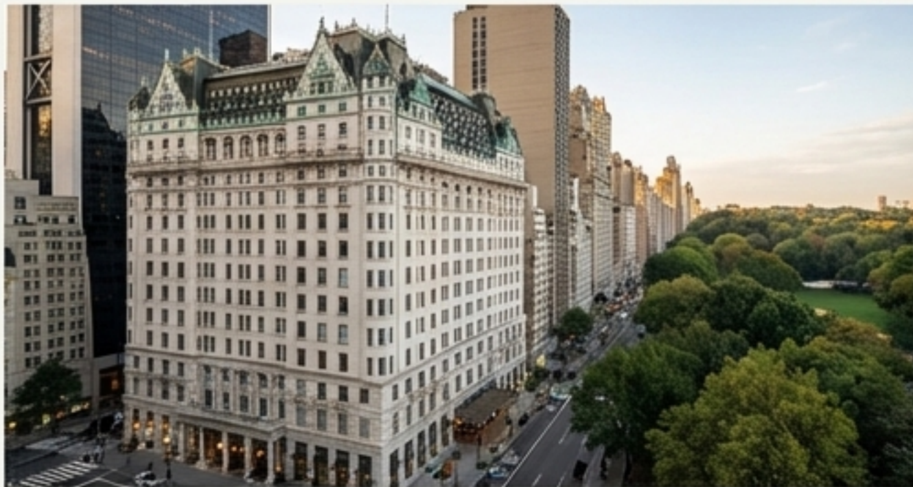
An enduring icon of luxury at the corner of Central Park.