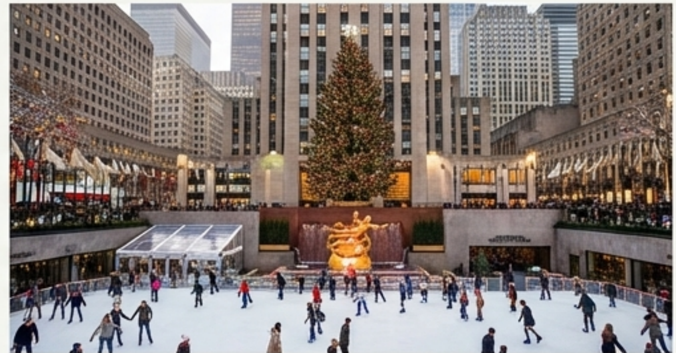
A historic complex of commerce and seasonal celebration.