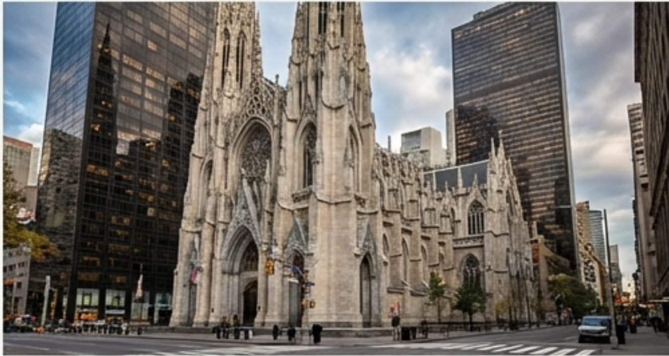
Gothic Revival splendor on Fifth Avenue.