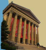
THE MUSEUM OF MODERN ART