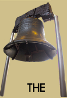
THE LIBERTY BELL