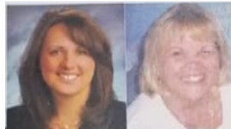
Goodheart Medical Group (775) 513-5038