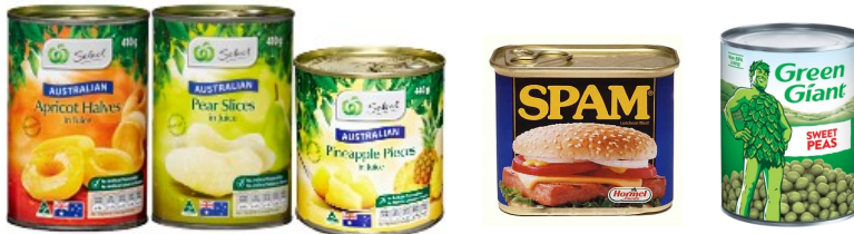
Name Brands are Copyrighted and are Registered Trademarks of their respective companies.