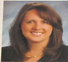
Goodheart Medical Group (775) 513-5038