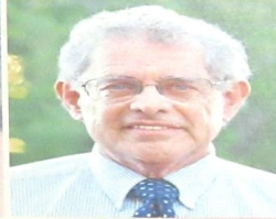
Reflections Healthcare (775) 727-7022