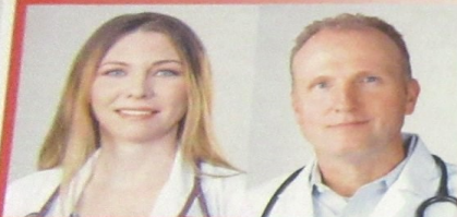
P3 Medical Group