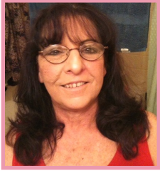
Editor Shades of Gray Monthly Newsletter