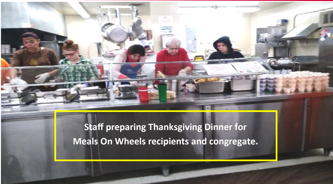
Staff preparing Thanksgiving Dinner for Meals On Wheels recipients and congregate.

You can also drop off your donation at the front desk at the Senior Center. Thank you!