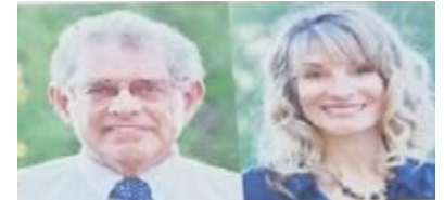
Reflections Healthcare (775) 727-7022