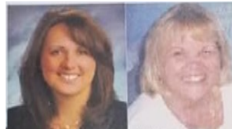
Goodheart Medical Group (775) 513-5038