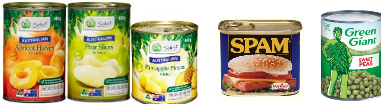
Name Brands are Copyrighted and are Registered Trademarks of their respective companies.